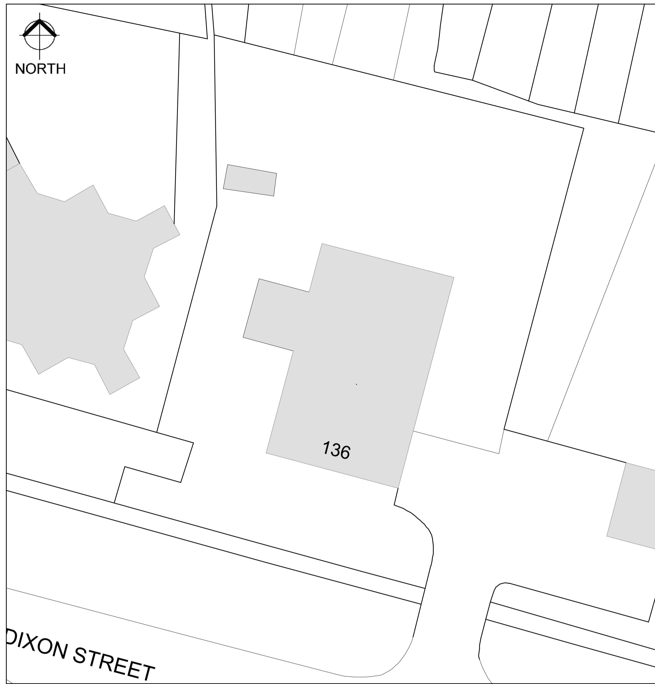
EXISTING SITE LAYOUT PLAN (1:250)