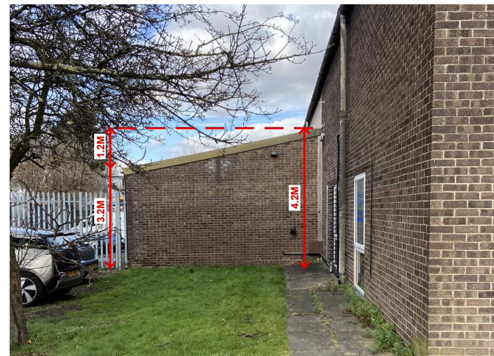
PHOTOGRAPH OF EXISTING FRONT ELEVATION WITH THE EXISTING & PROPOSED ROOF HEIGHTS INDICATED