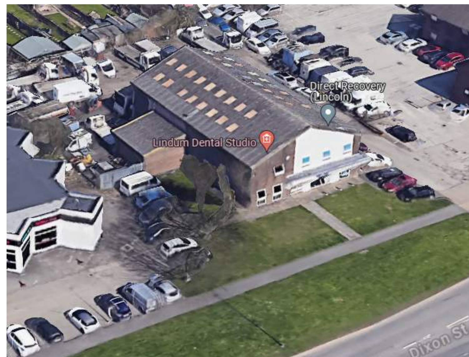
GOOGLE MAPS VIEW