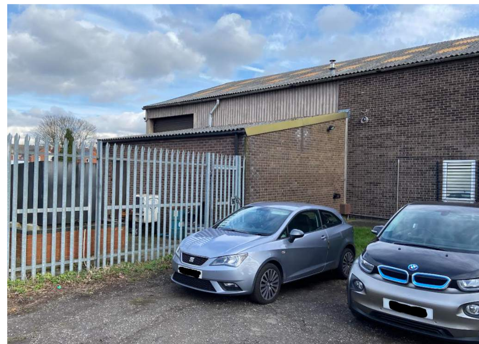
PHOTOGRAPH OF EXISTING FRONT & SIDE ELEVATION