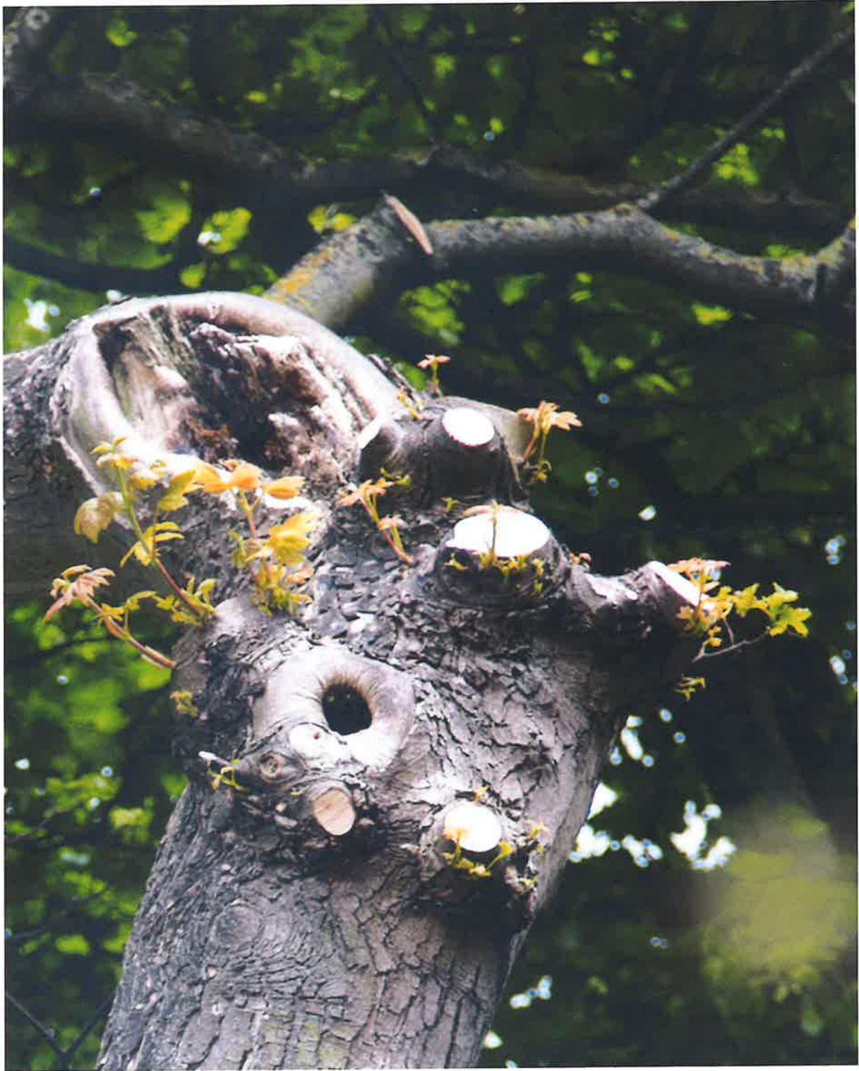
PHOTO TAKEN AFTER PREVIOUS PRUNING. APPROX 2016 EPICORMIC GROWTH REMOVED