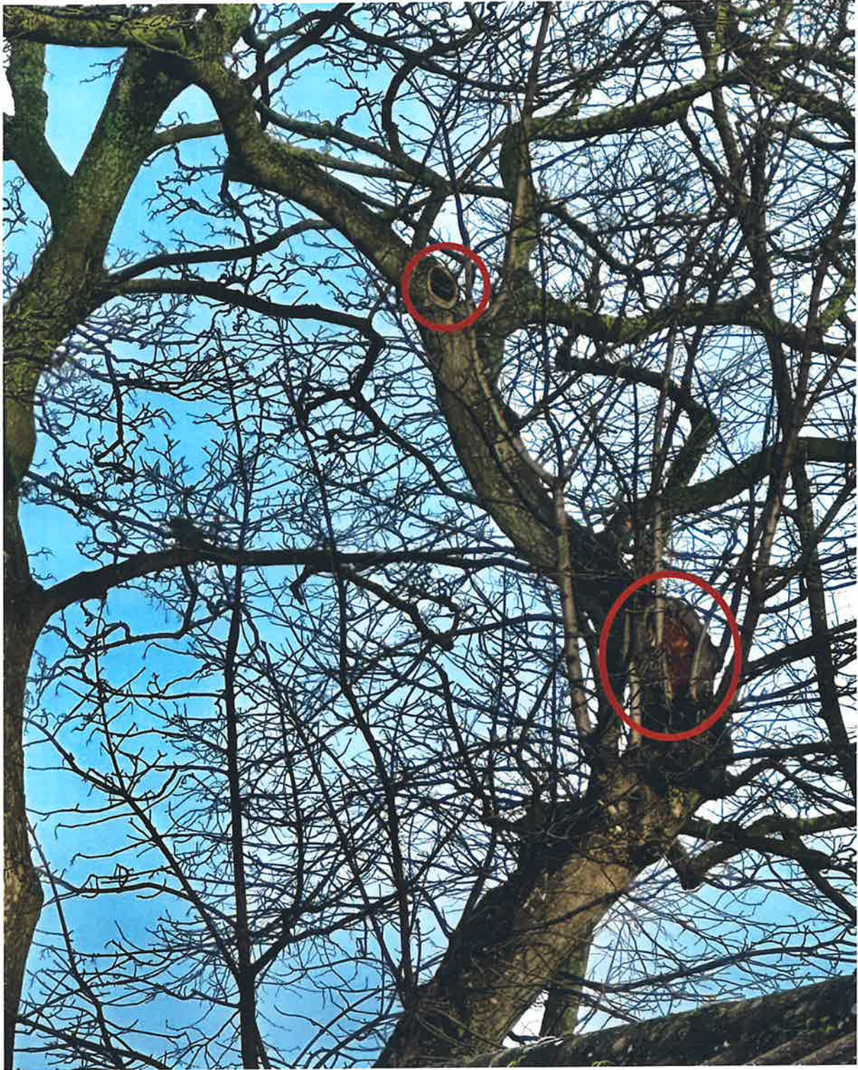
PHOTO TAKEN FROM GROUND LEVEL 2023 SHOWING TWO LARGEST CAVITIES. LOWER ONE, ON THE ELBOW OF TREE.