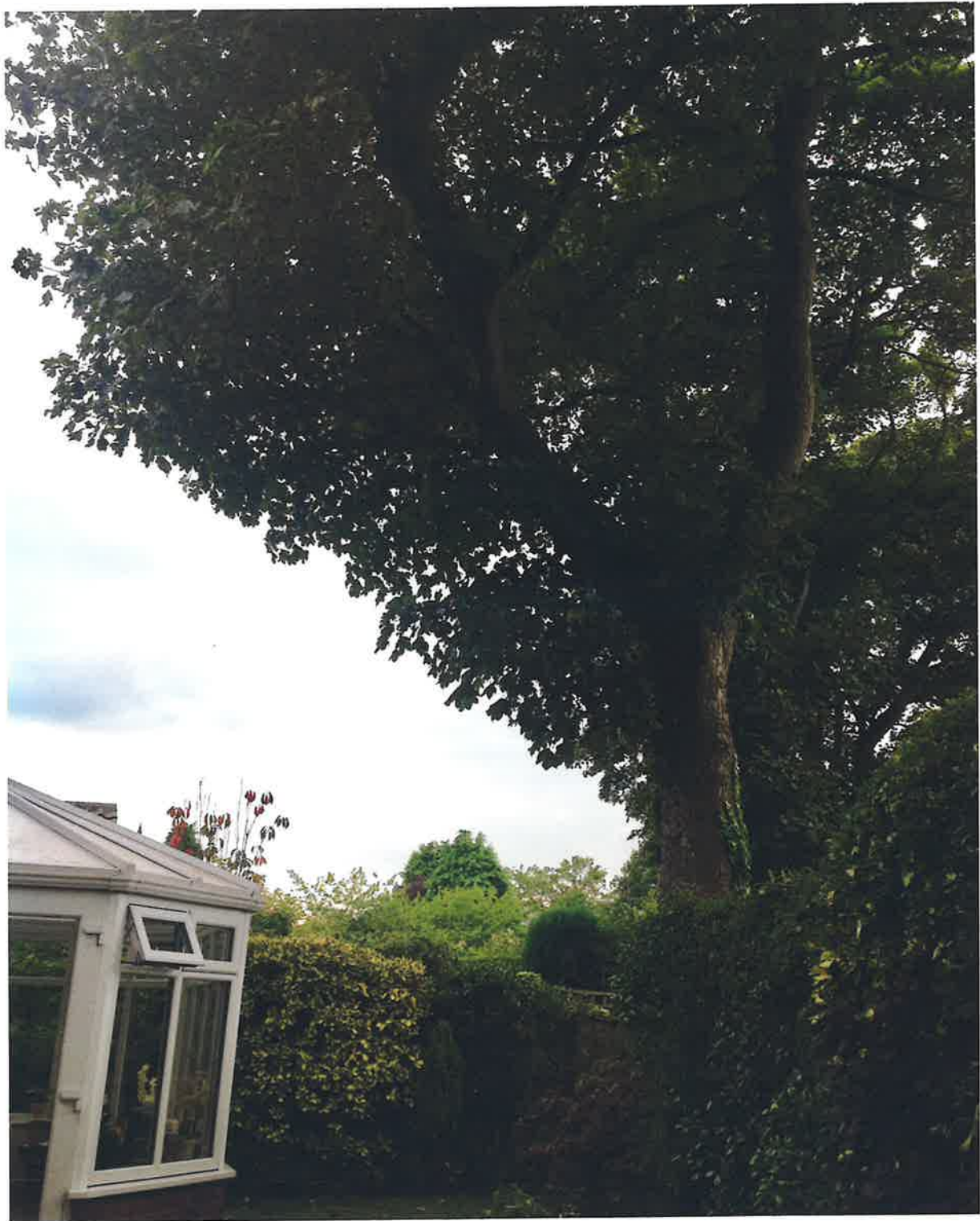
PHOTO SHOWING TREE IN FULL LEAF 2023. CAVITIES NO LONGER VISIBLE FROM THE GROUND.