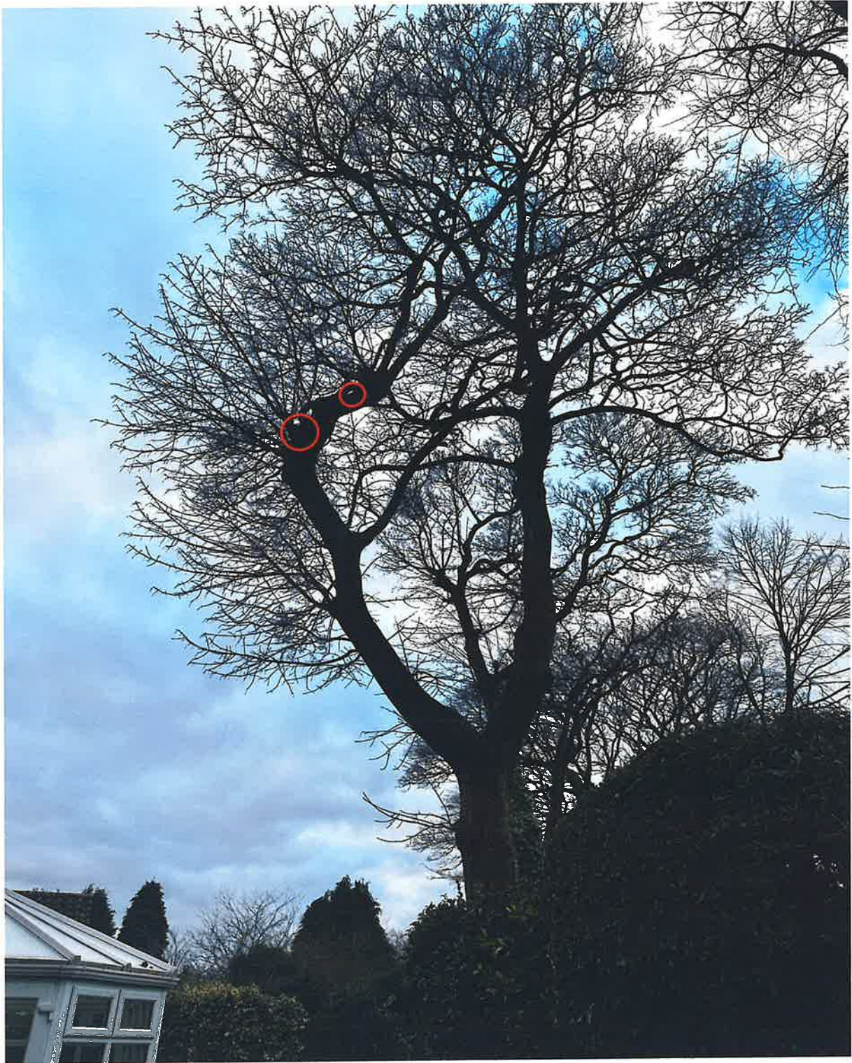
PHOTO SHOWING POSITION OF THE TREE AND CAVITIES. 2023.