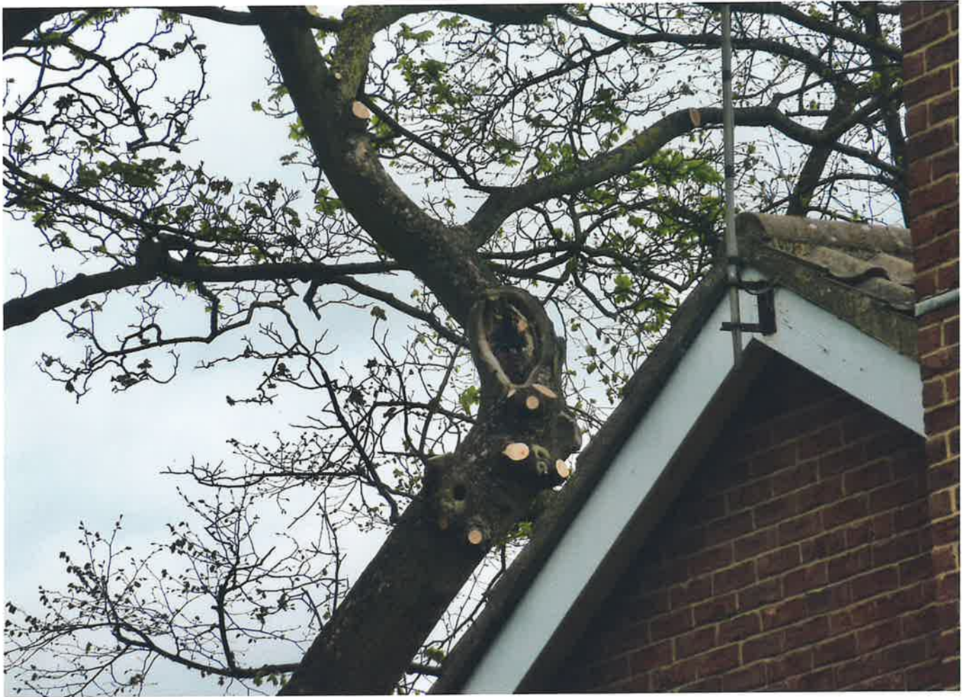
PHOTO TAKEN FROM GROUND LEVEL, APPROX 2016 EPICORMIC GROWTH REMOVED.