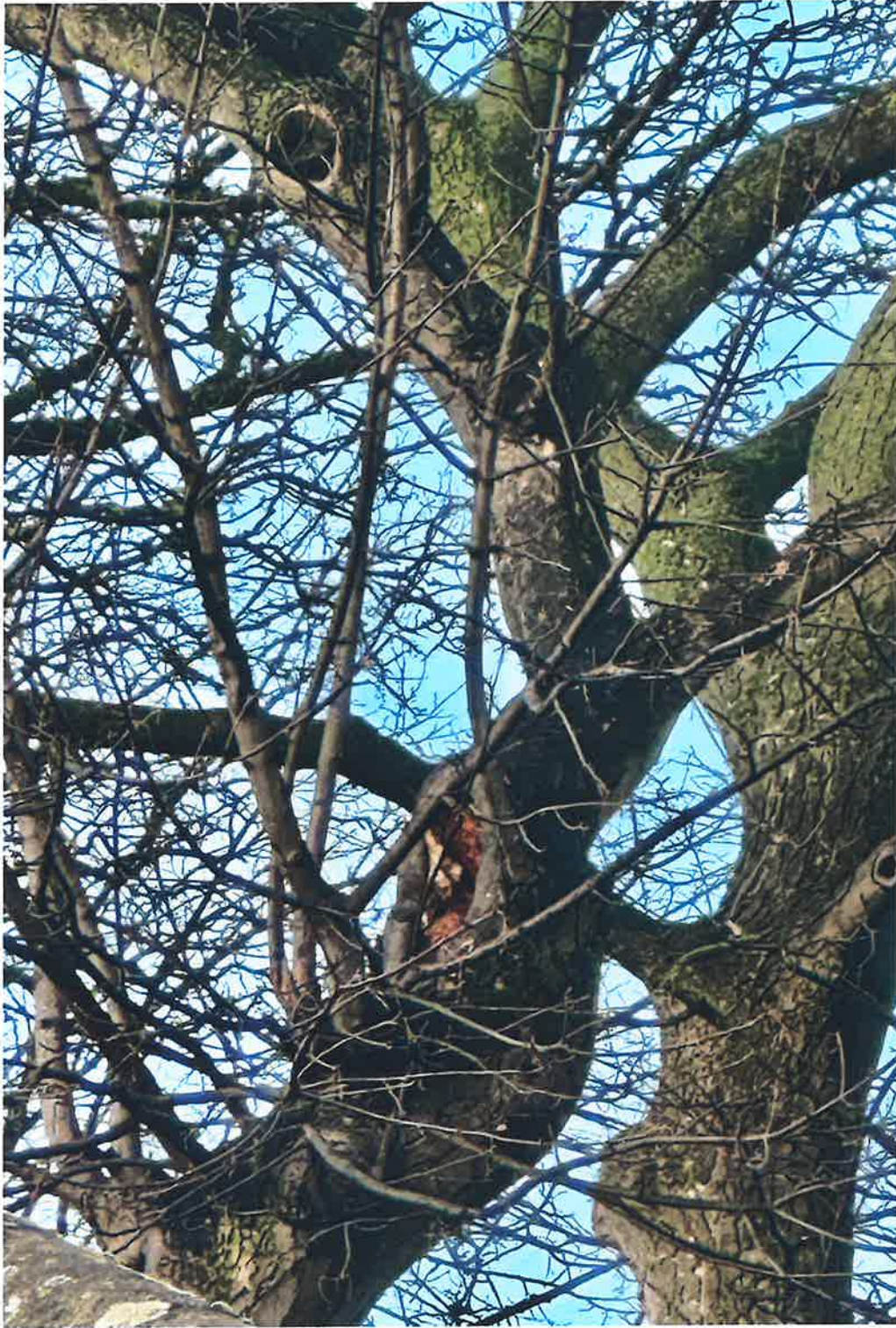
PHOTO TAKEN FROM GROUND LEVEL 2023 SHOWING NEW EPICORMIC GROWTH COVERING A LARGE AREA OF THE LARGEST CAVITY.