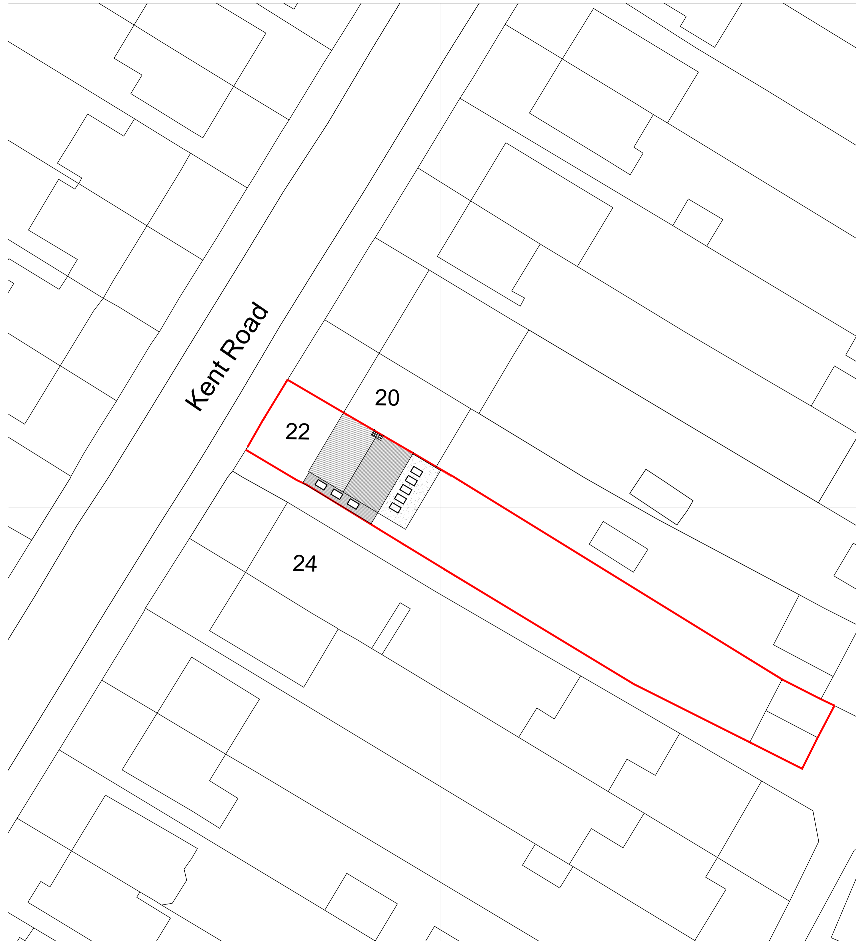
BLOCK PLAN (SHOWING PROPOSED) Scale 1:200