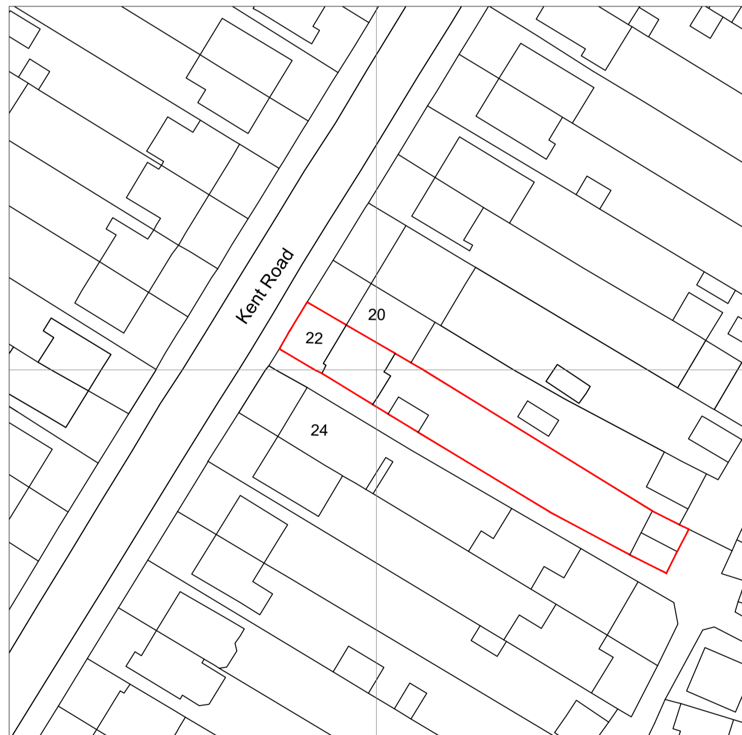
SITE LOCATION Scale 1:500