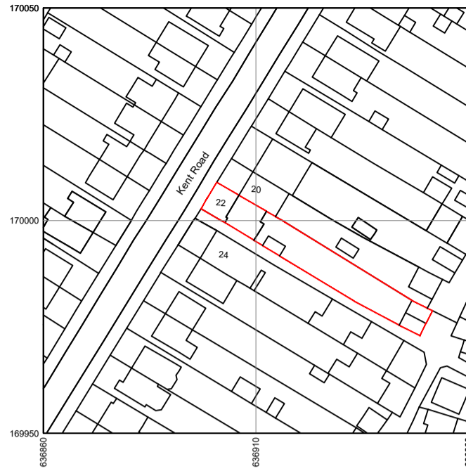
SITE LOCATION Scale 1:1250