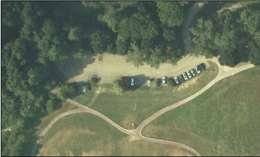
FIGURE 1: SITE LOCATION AS OF 1 ST JANUARY 2008