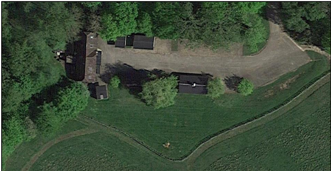
FIGURE 8: SITE LOCATION AS OF 5 TH MAY 2018