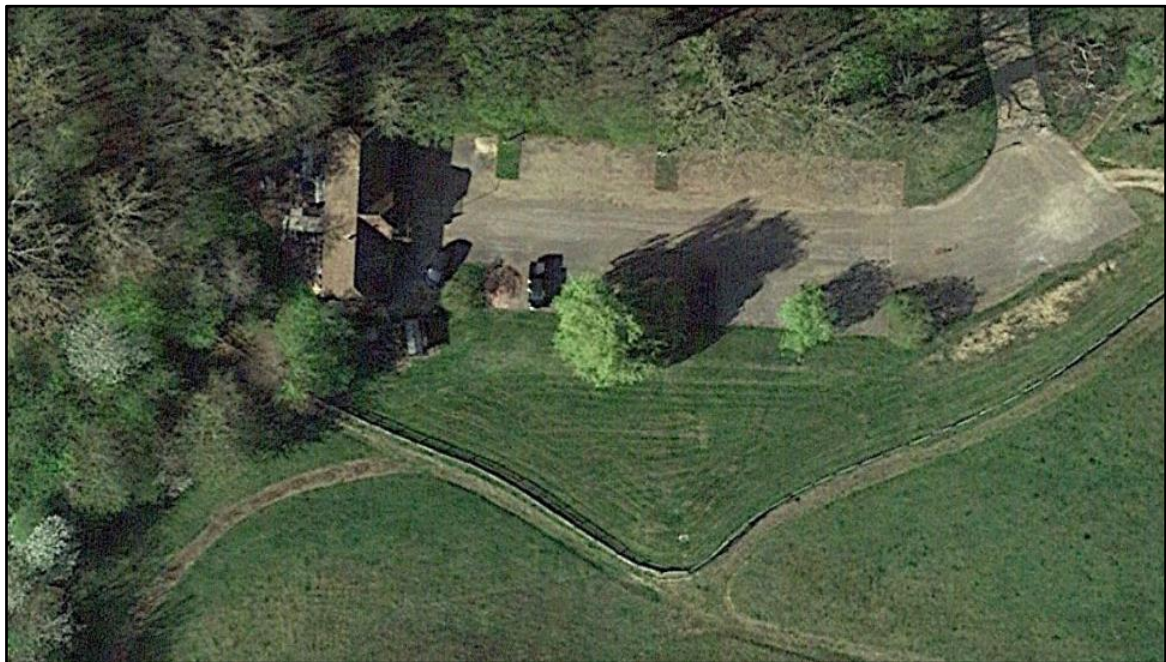
FIGURE 6: SITE LOCATION AS OF 20 TH APRIL 2015