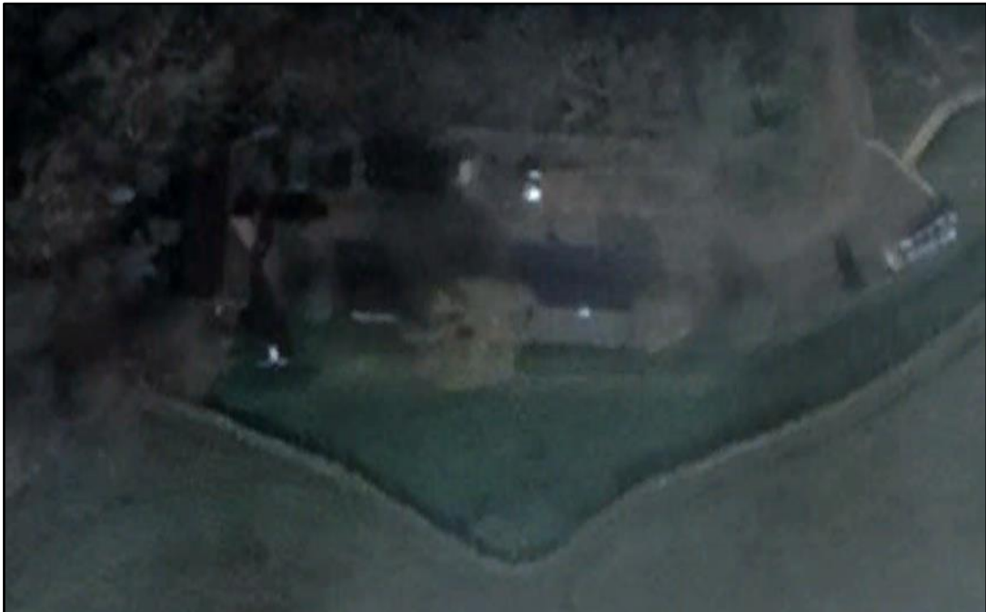
FIGURE 10: SITE LOCATION AS OF 23 RD FEBRUARY 2021