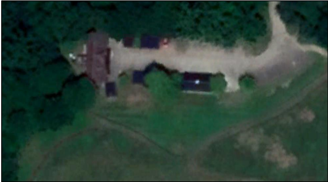
FIGURE 7: SITE LOCATION AS OF 2 ND JULY 2017