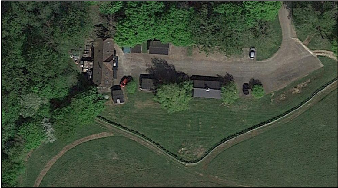
FIGURE 9: SITE LOCATION AS OF 23 RD APRIL 2020