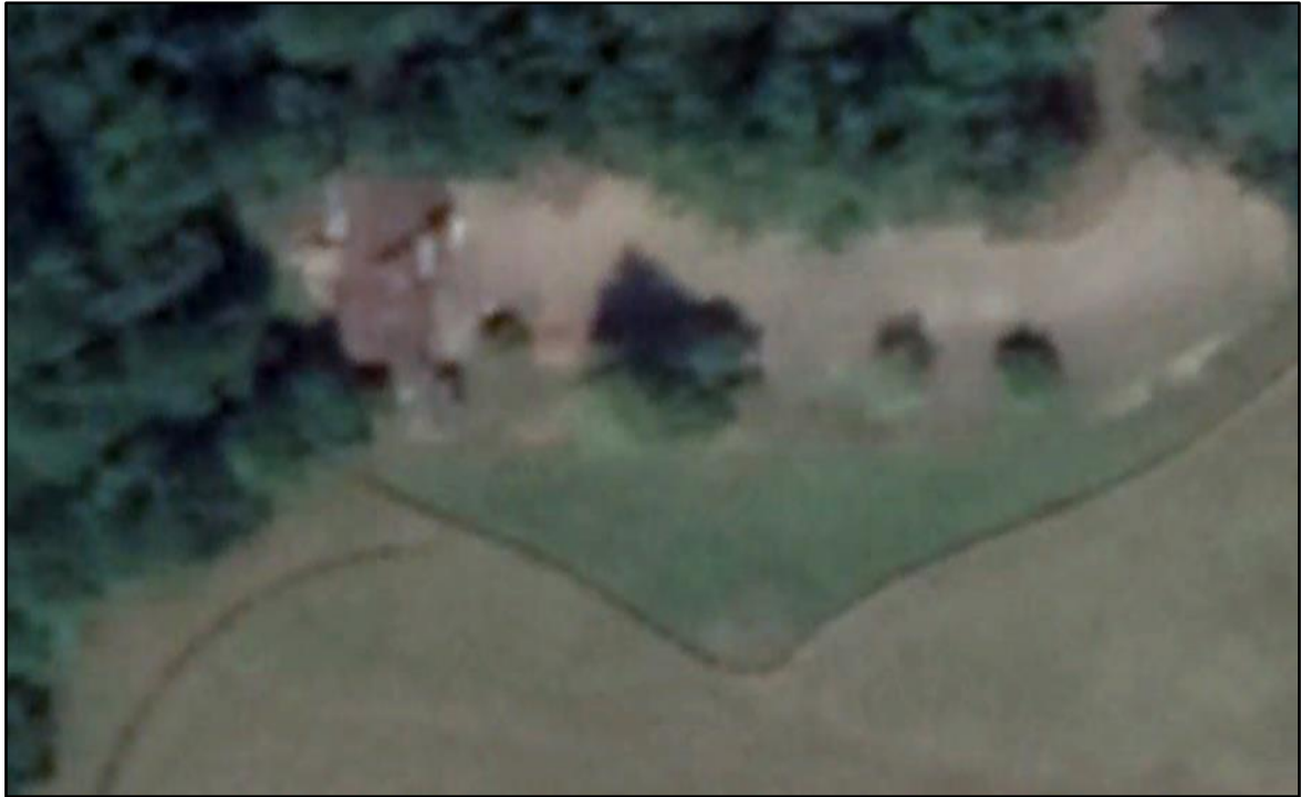
FIGURE 5: SITE LOCATION AS OF 26 TH JULY 2014