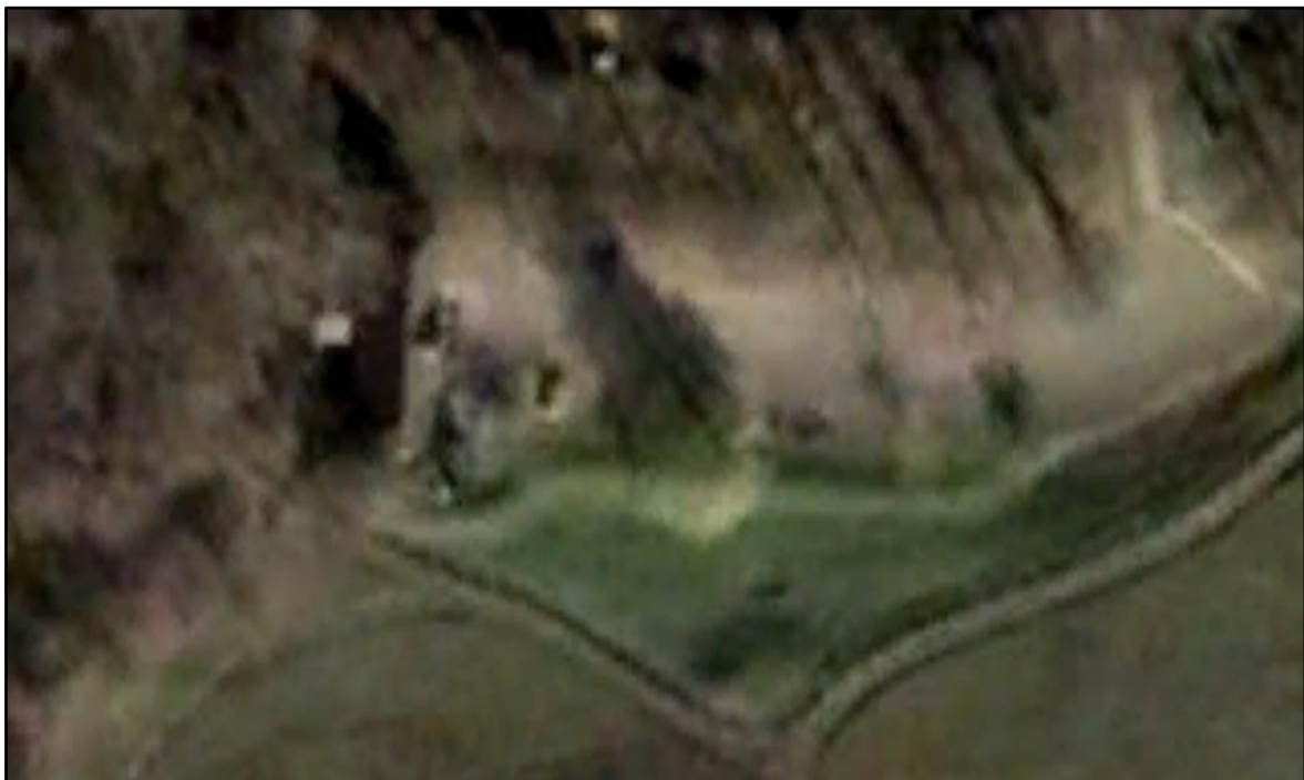
FIGURE 4: SITE LOCATION AS OF 9 TH MARCH 2014