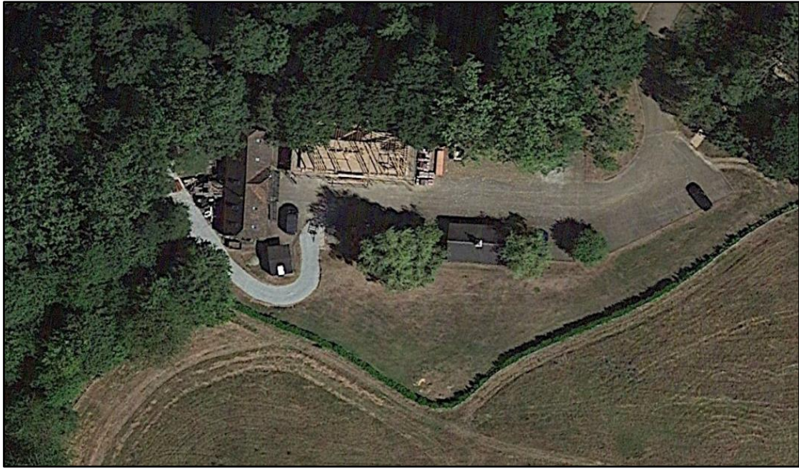
FIGURE 11: SITE LOCATION AS OF 5 TH AUGUST 2022