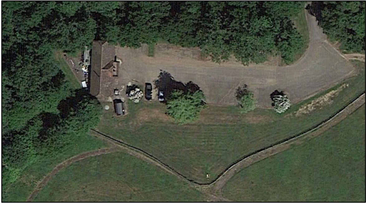
FIGURE 3: SITE LOCATION AS OF 9 TH JULY 2013