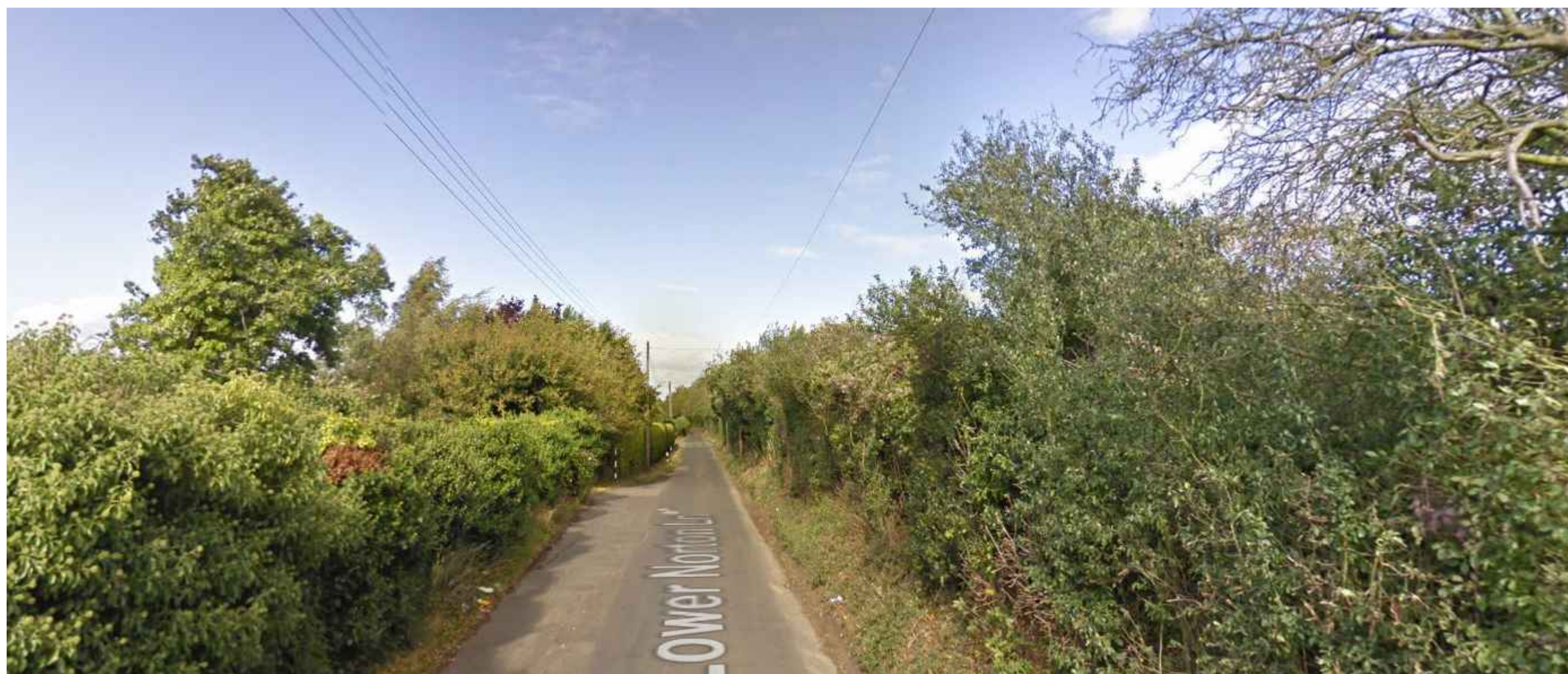
STREET VIEW - Looking North along Lower Norton Lane - Boundary of Toft Wray on right hand side

prince&gisbey architects RIBA Chartered Practice