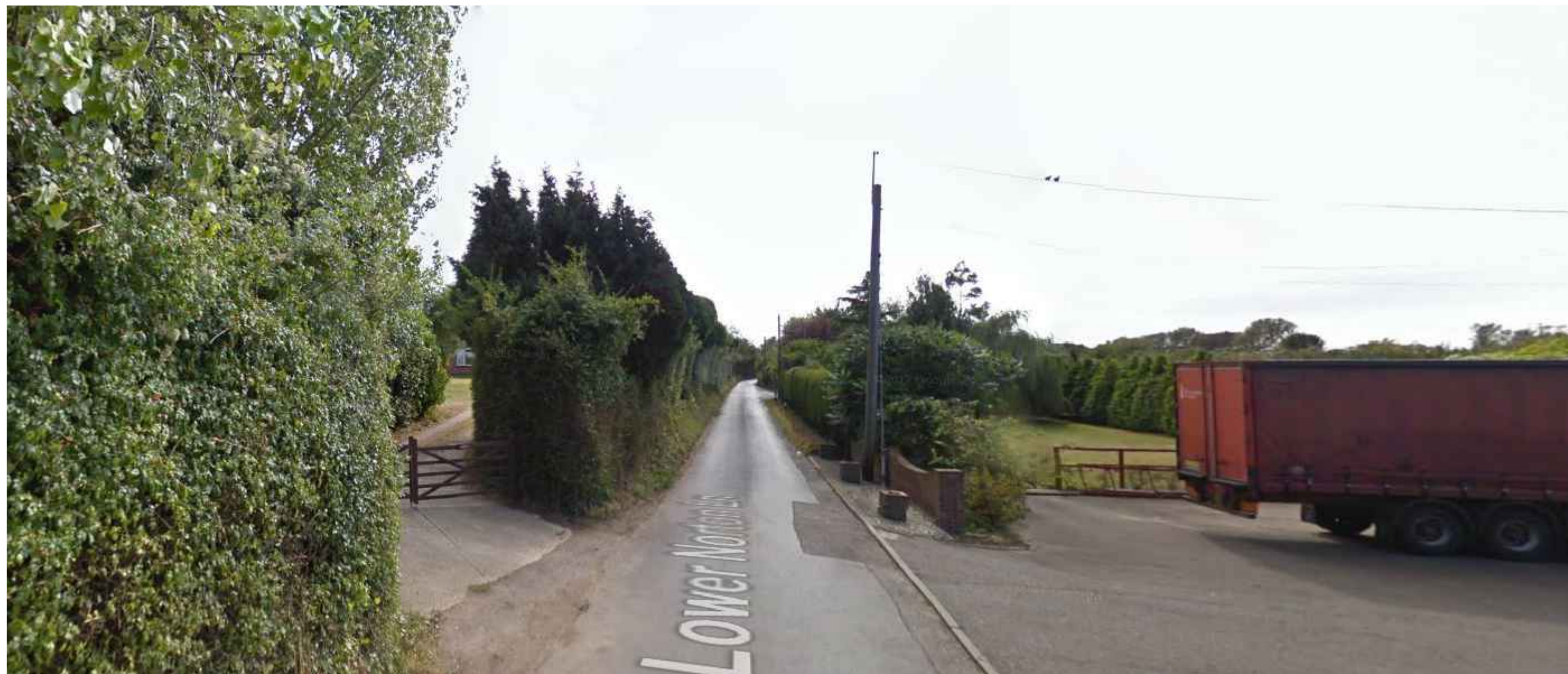
STREET VIEW - Looking South along Lower Norton Lane - Entrance to Toft Wray on left