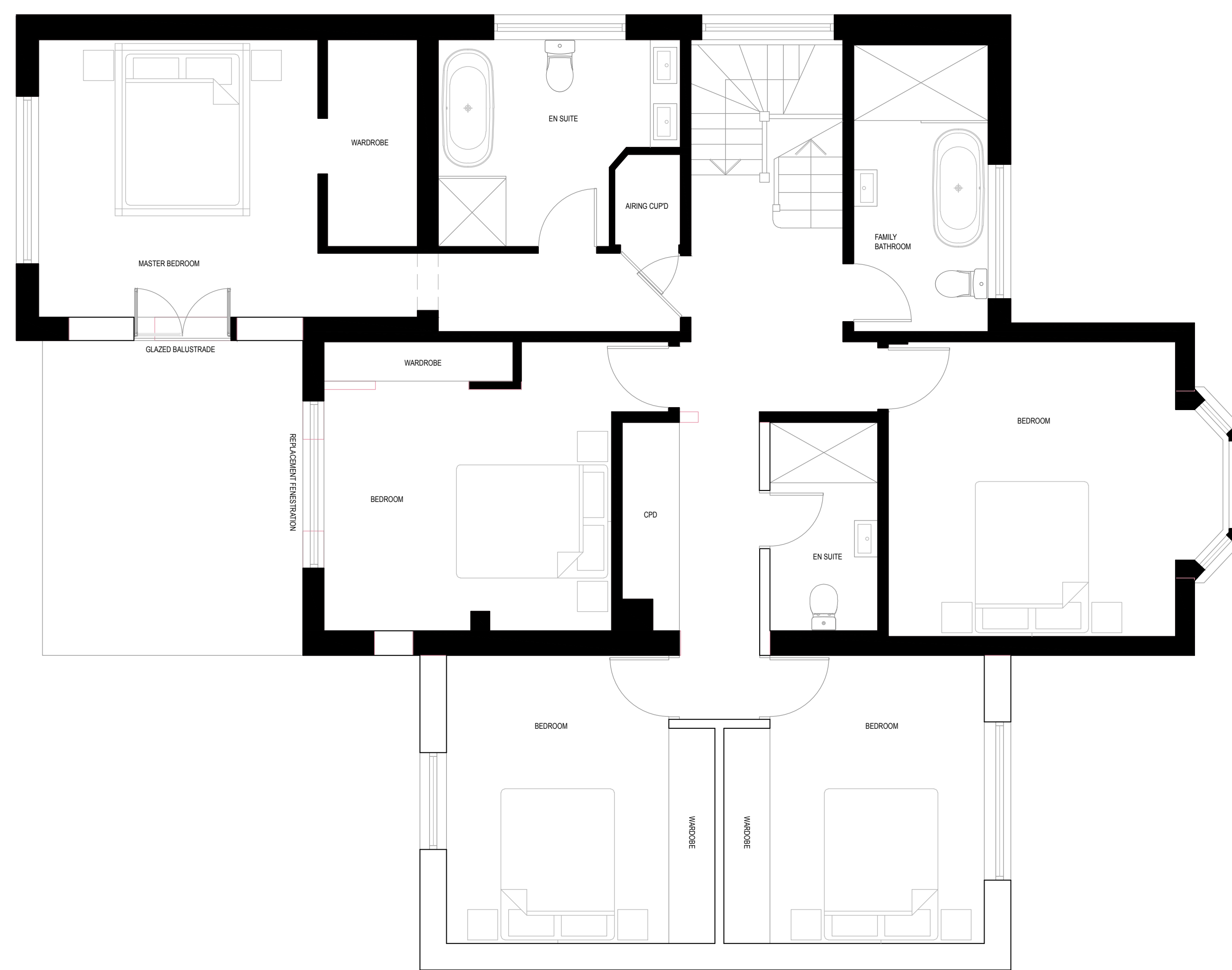
PROPOSED FIRST FLOOR PLAN Scale 1:50