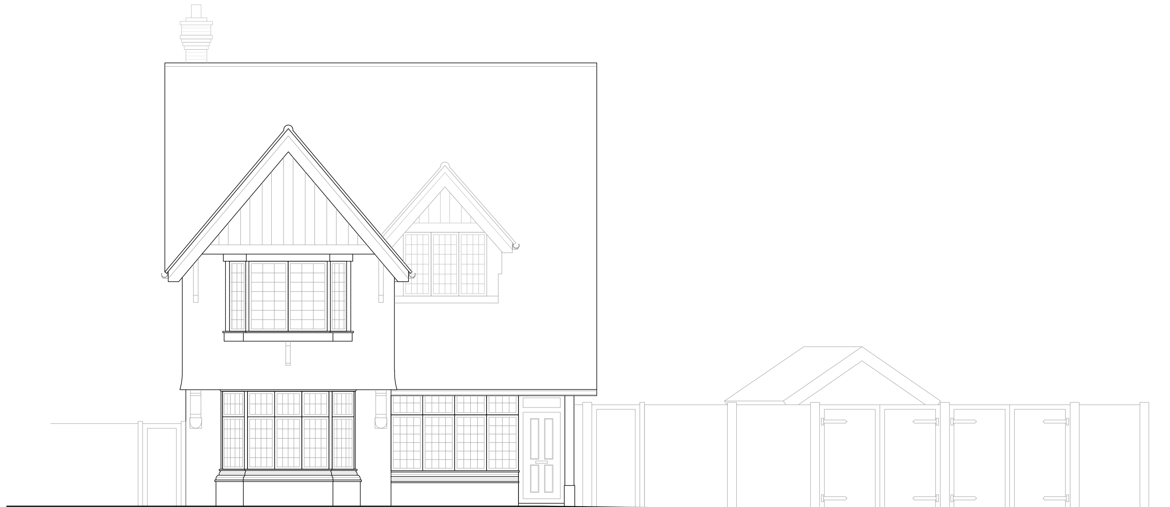
EXISTING NORTH EAST ELEVATION Scale 1:50