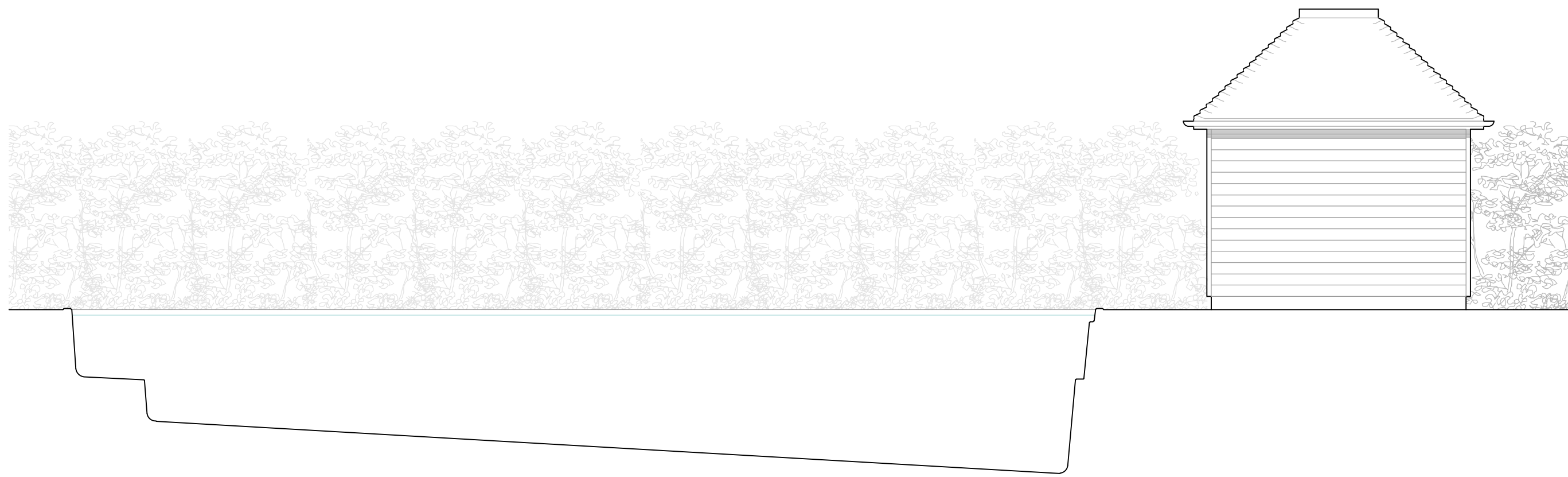
PROPOSED SOUTH WEST ELEVATION Scale 1:50