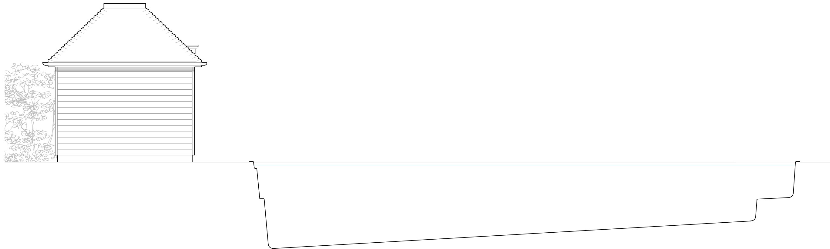
PROPOSED SOUTH EAST ELEVATION Scale 1:50