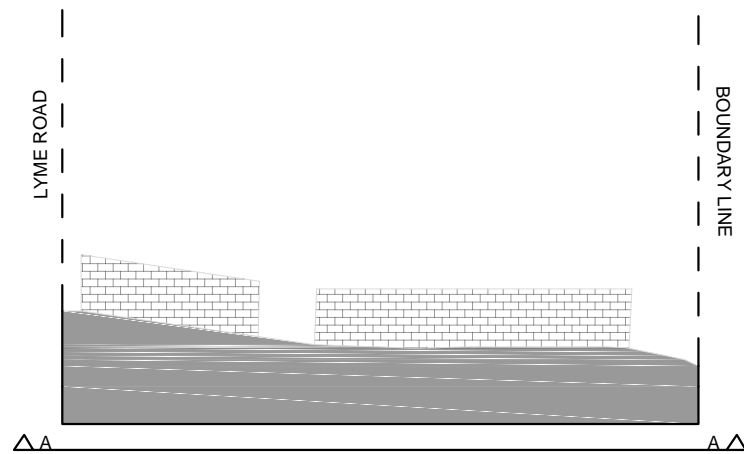
EXISTING STREET SCENE Scale: 0m, 4m, 8m, 12m. 1/200