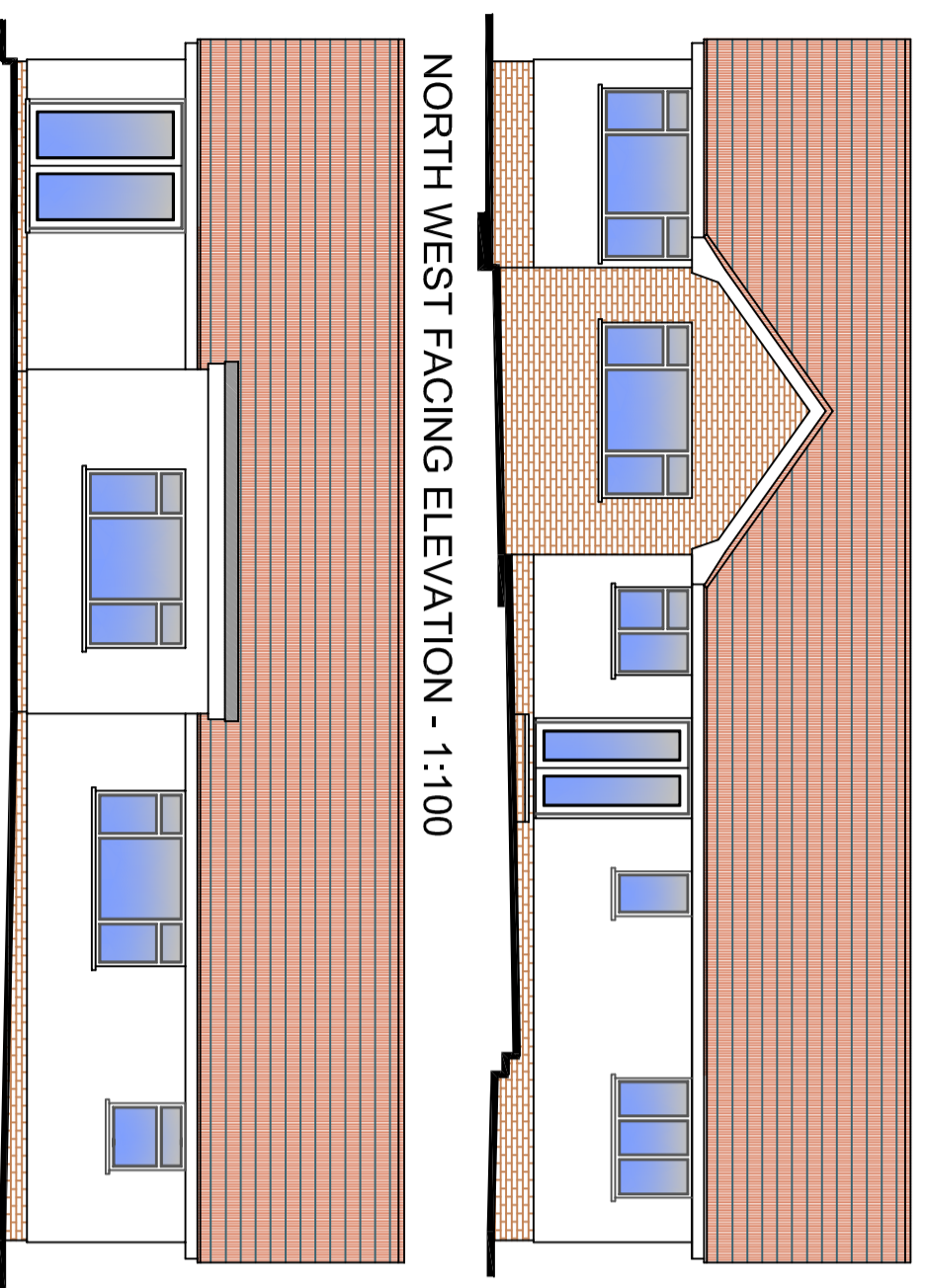
SOUTH EAST FACING ELEVATION - 1:100