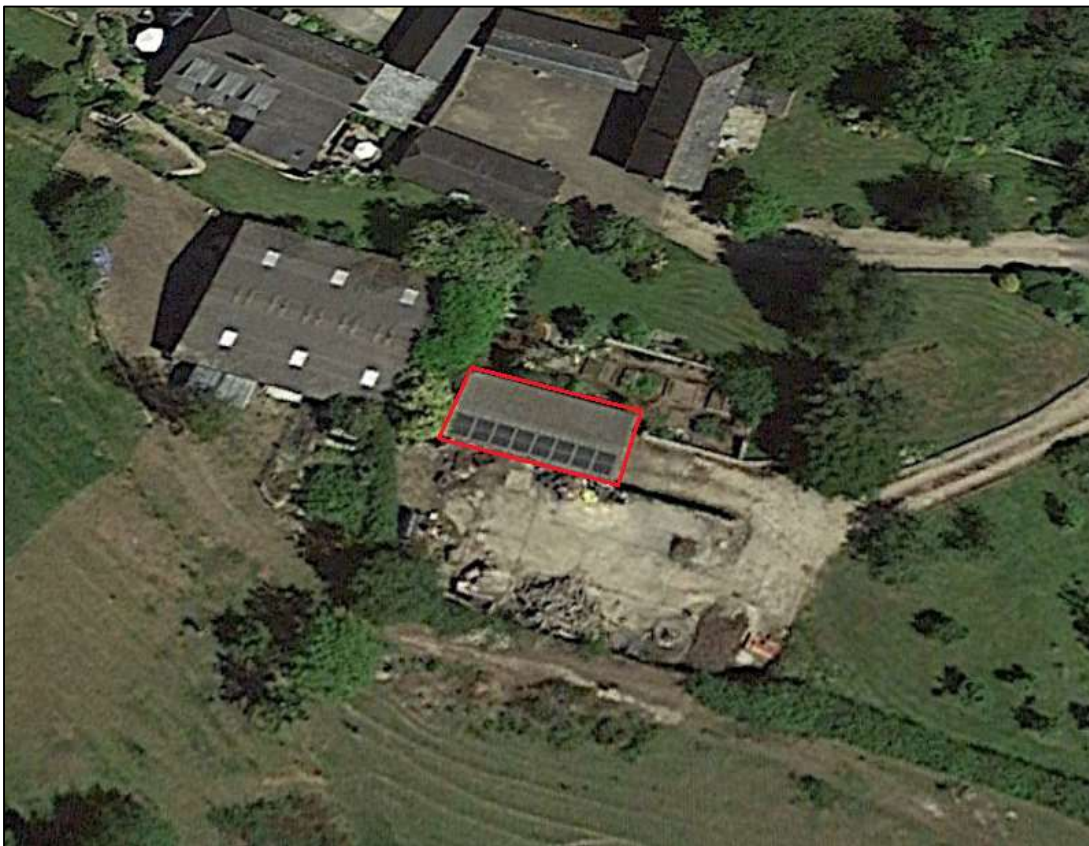
Figure 1. Location of the barn.

SWE was commissioned by D & S Denning to undertake an ecological assessment of a detached barn within the grounds of Holcombe Granary, Holcombe Lane, Uplyme, Lyme Regis, DT7 3SN (Ordnance Survey grid reference SY316930 – see Figure 1). The survey was required to support a planning application for conversion of the barn to a dwelling. The Devon Wildlife Checklist is appended to this report.