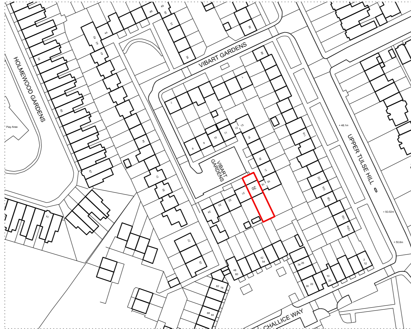
SITE LOCATION PLAN - EXISTING SCALE 1:1250 @ A3

All dimensions are in mm unless noted otherwise.