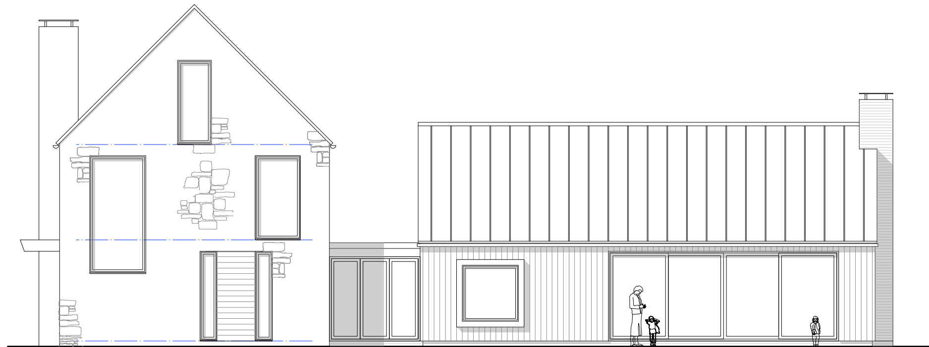
SOUTHWEST ELEVATION 1:100

MATERIALS ROOF: Metal WALLS: Stone + Vertical Cladding WINDOWS: Aluminium DOORS: Aluminium