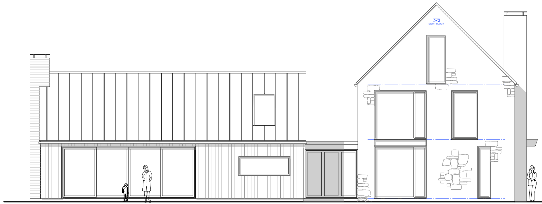
NORTHEAST ELEVATION 1:100

MATERIALS ROOF: Metal WALLS: Stone + Vertical Cladding WINDOWS: Aluminium DOORS: Aluminium