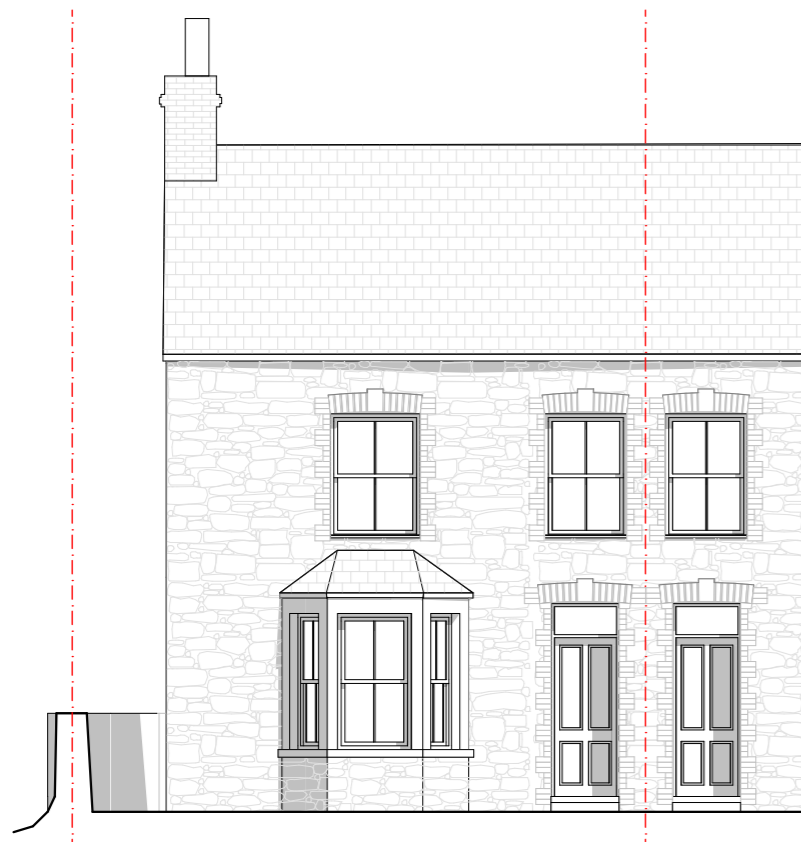
E-01 PROPOSED NORTH ELEVATION 1:100