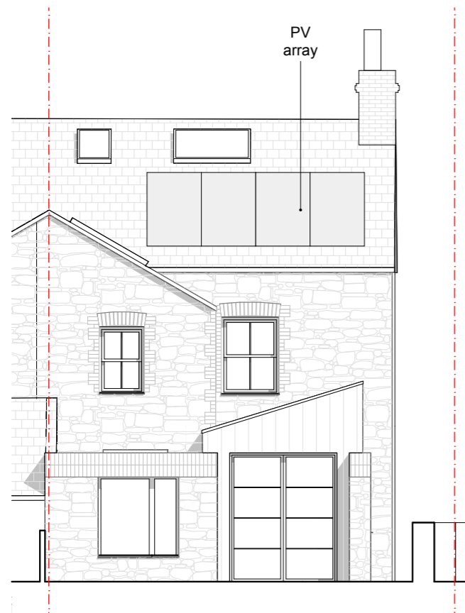
E-03 PROPOSED SOUTH ELEVATION 1:100