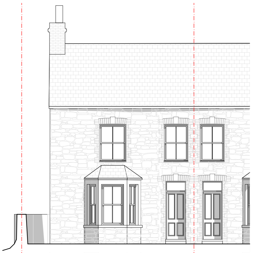
E-01 EXISTING NORTH ELEVATION 1:100

EXISTING MATERIALS Walls: stone, brick infill and detailing, painted render Roof: slate, terracotta decorative ridge tiles Windows: timber Rooflights: aluminium Guttering: UPVC