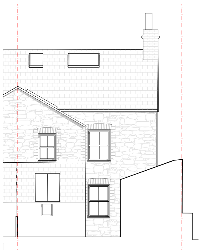
E-03 EXISTING SOUTH ELEVATION 1:100