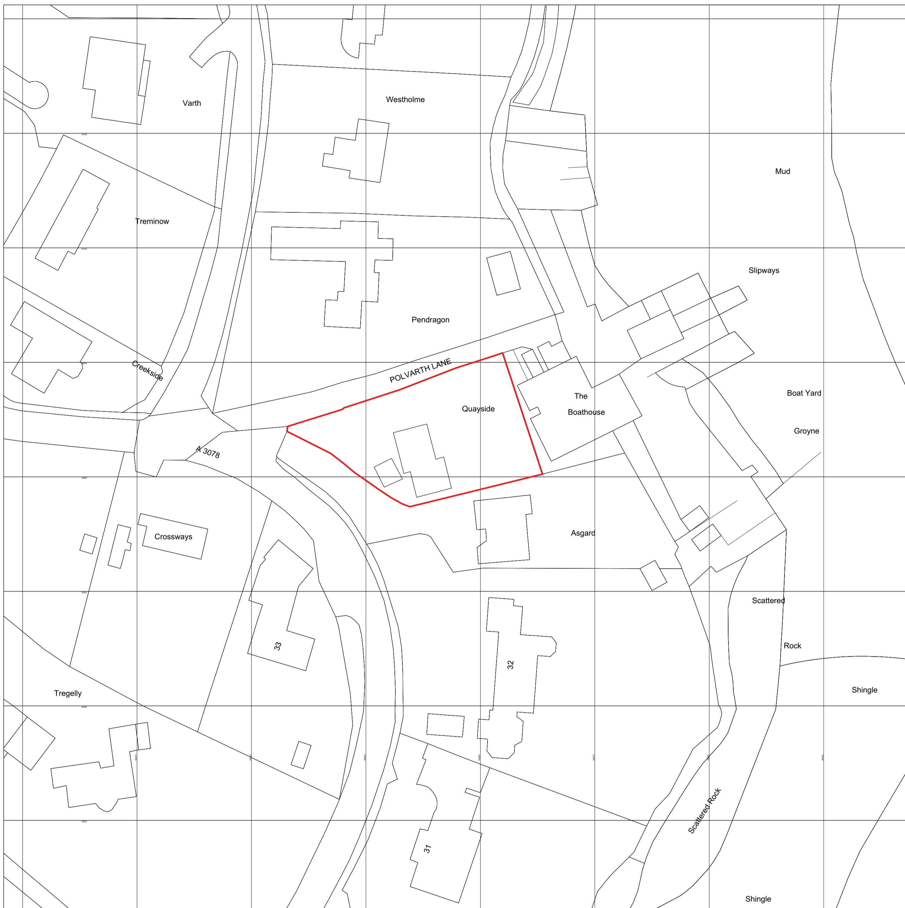
Location Plan Scale 1:500 @ A1 1:1000 @ A3 0 5.0 10.0 15.0 20.0 M

Key Site subject to current pre-app advice