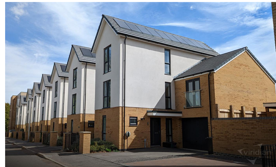
Low Profile Solar Panels