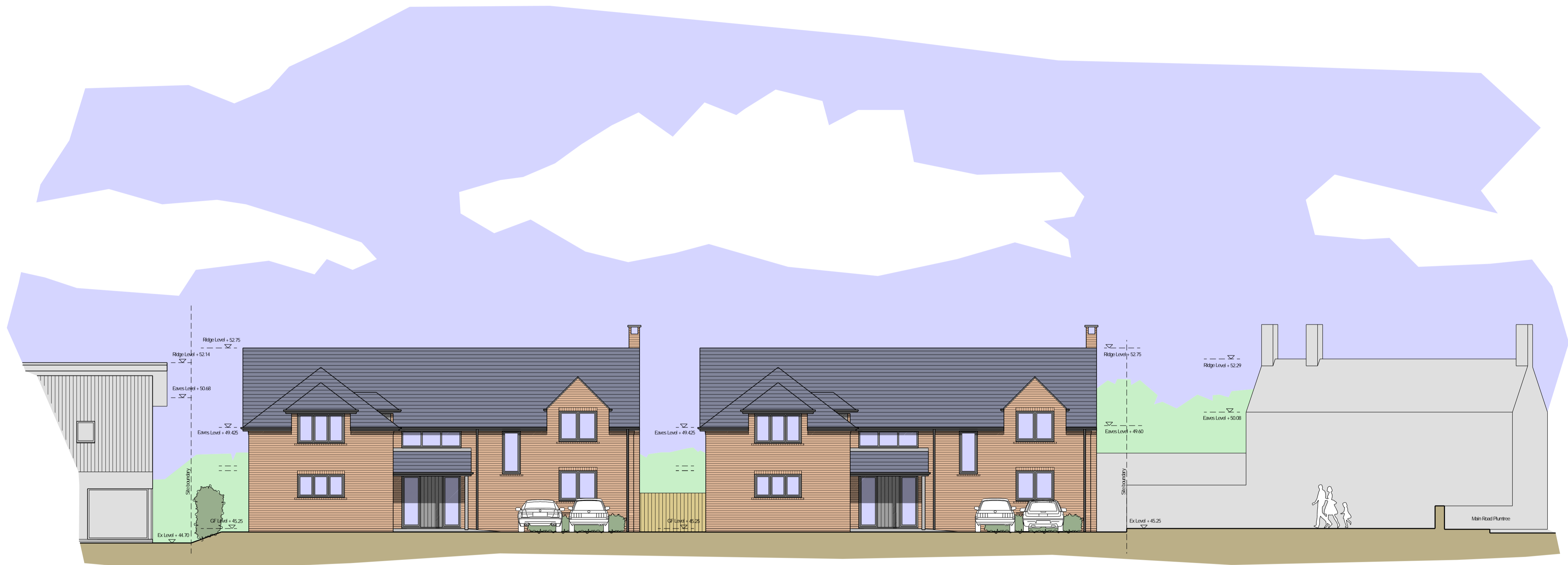
Street Scene Drawing Scale 1:100 at A1