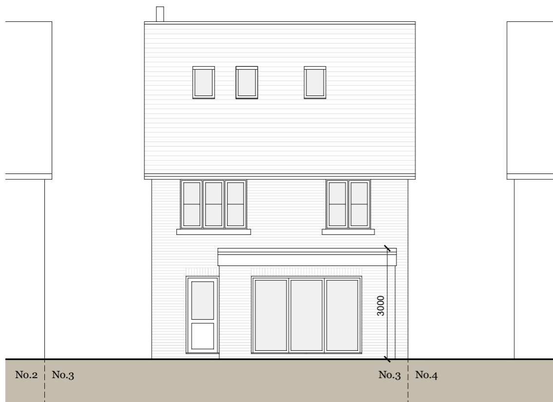
Rear elevation (north west)