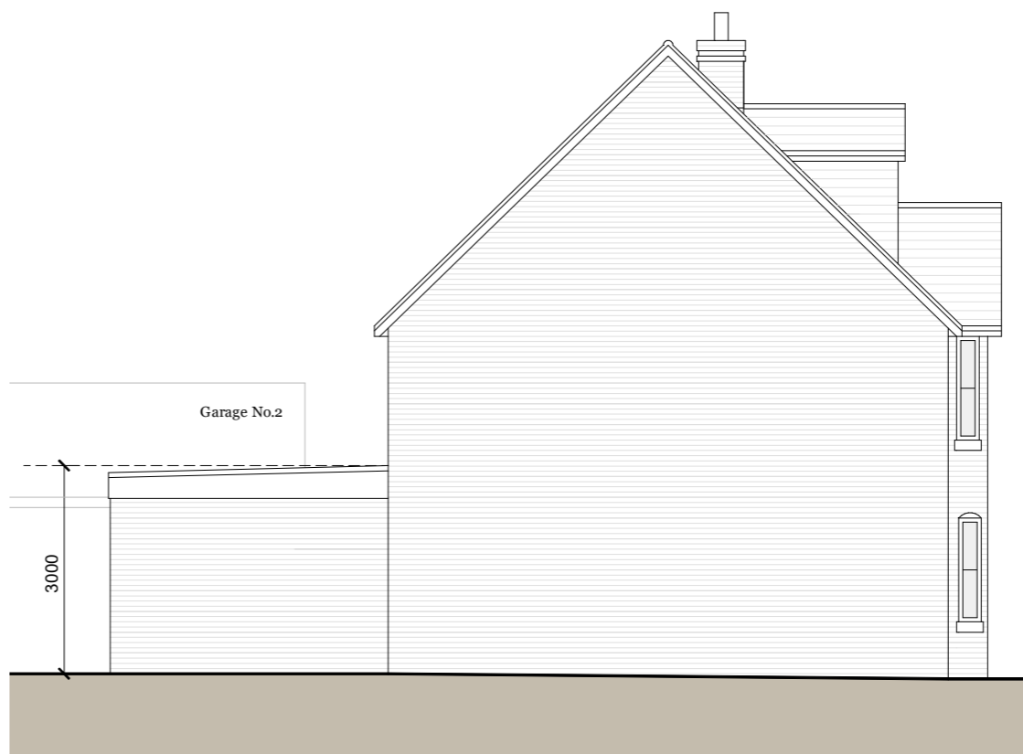
Side elevation (south west)