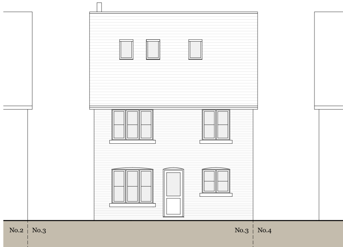
Rear elevation (north west)