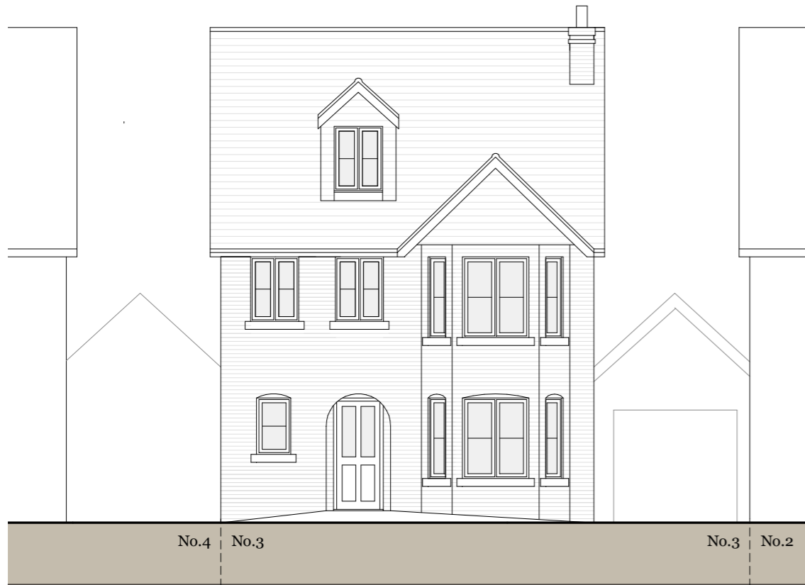
Front elevation (south east)