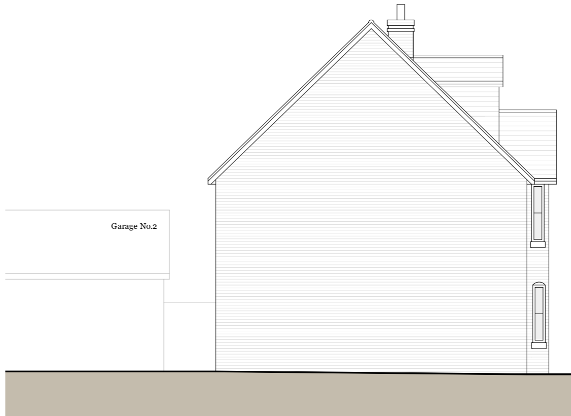
Side elevation (south west)