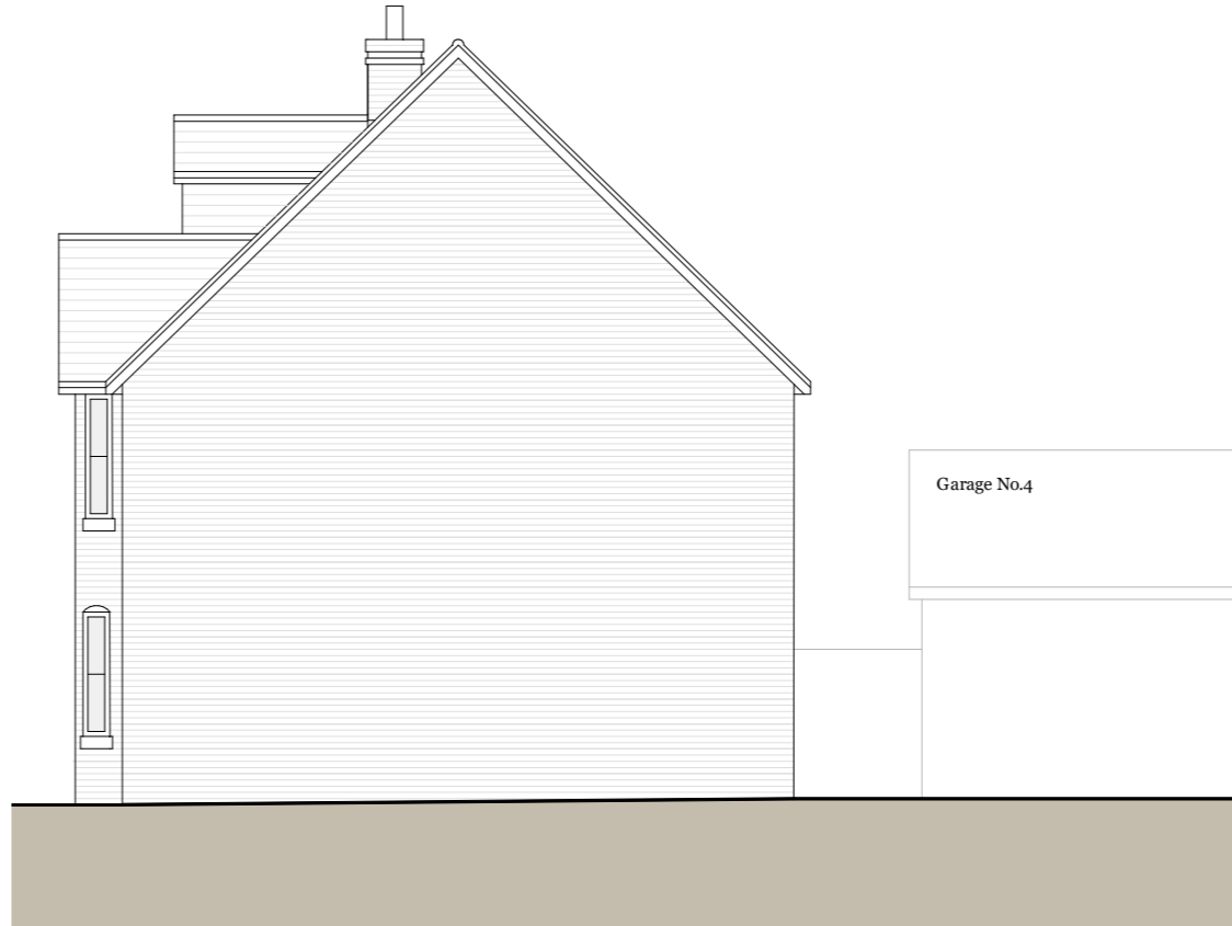
Side elevation (north east)