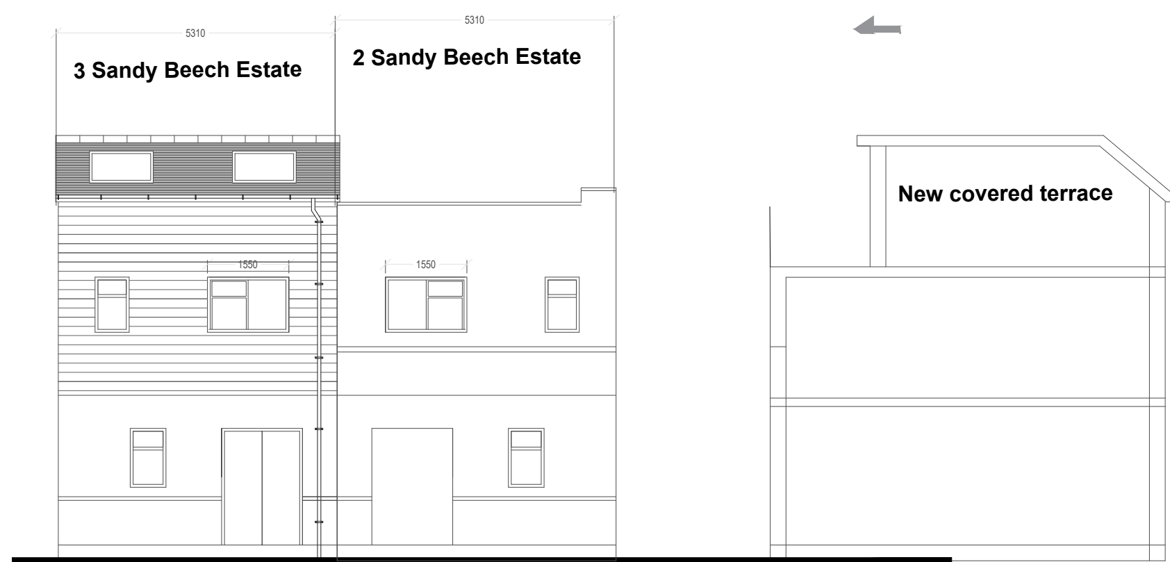
Proposed rear Elevation (North)