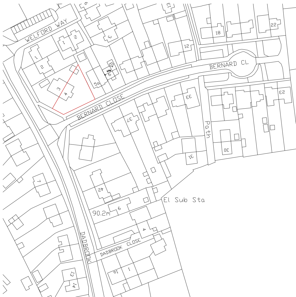
Location Plan @1:1250 1:1250