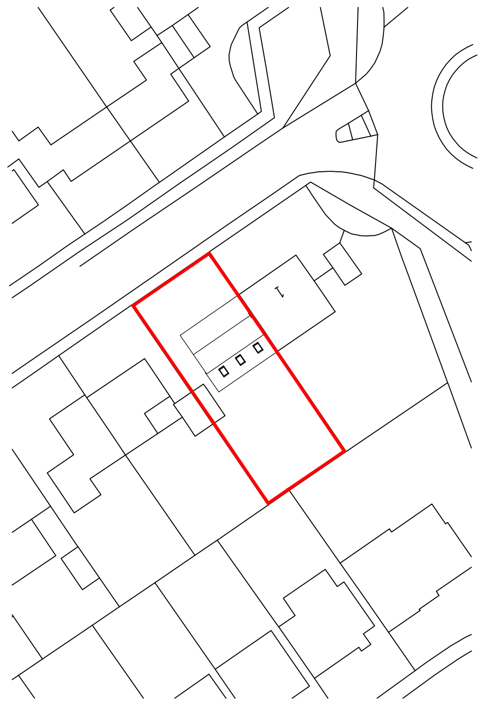
Existing Block Plan 1:500