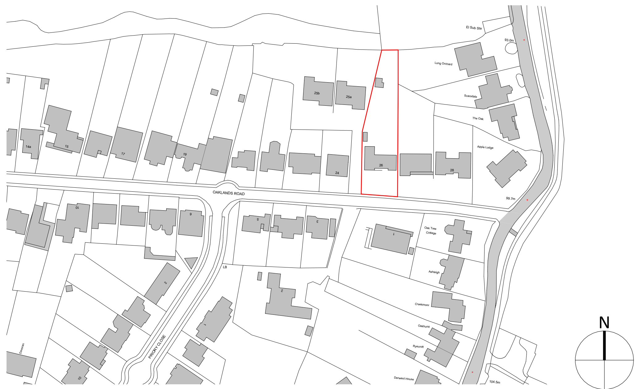
Site Location Plan 1 : 1250