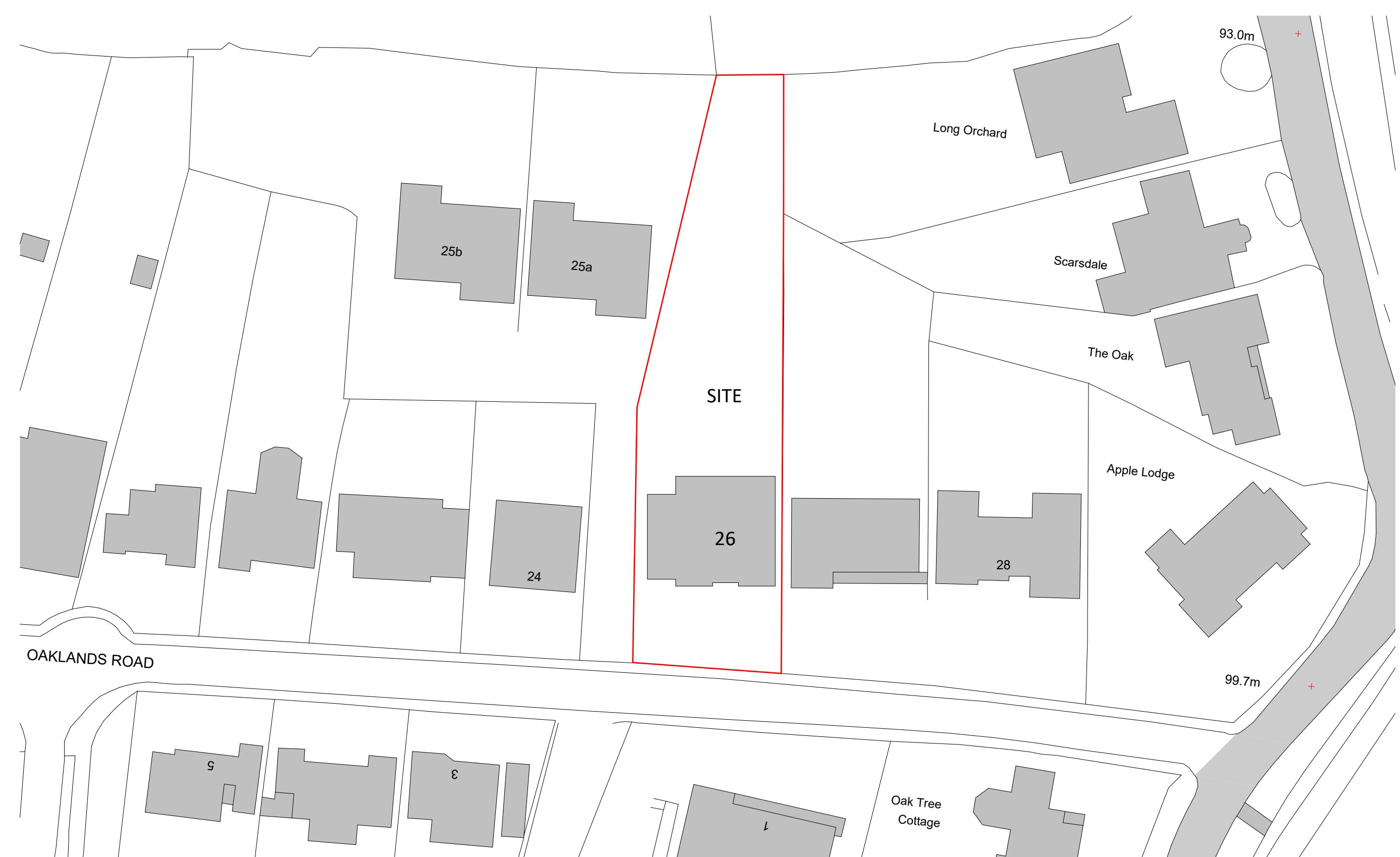
Proposed Block Plan 1 : 500