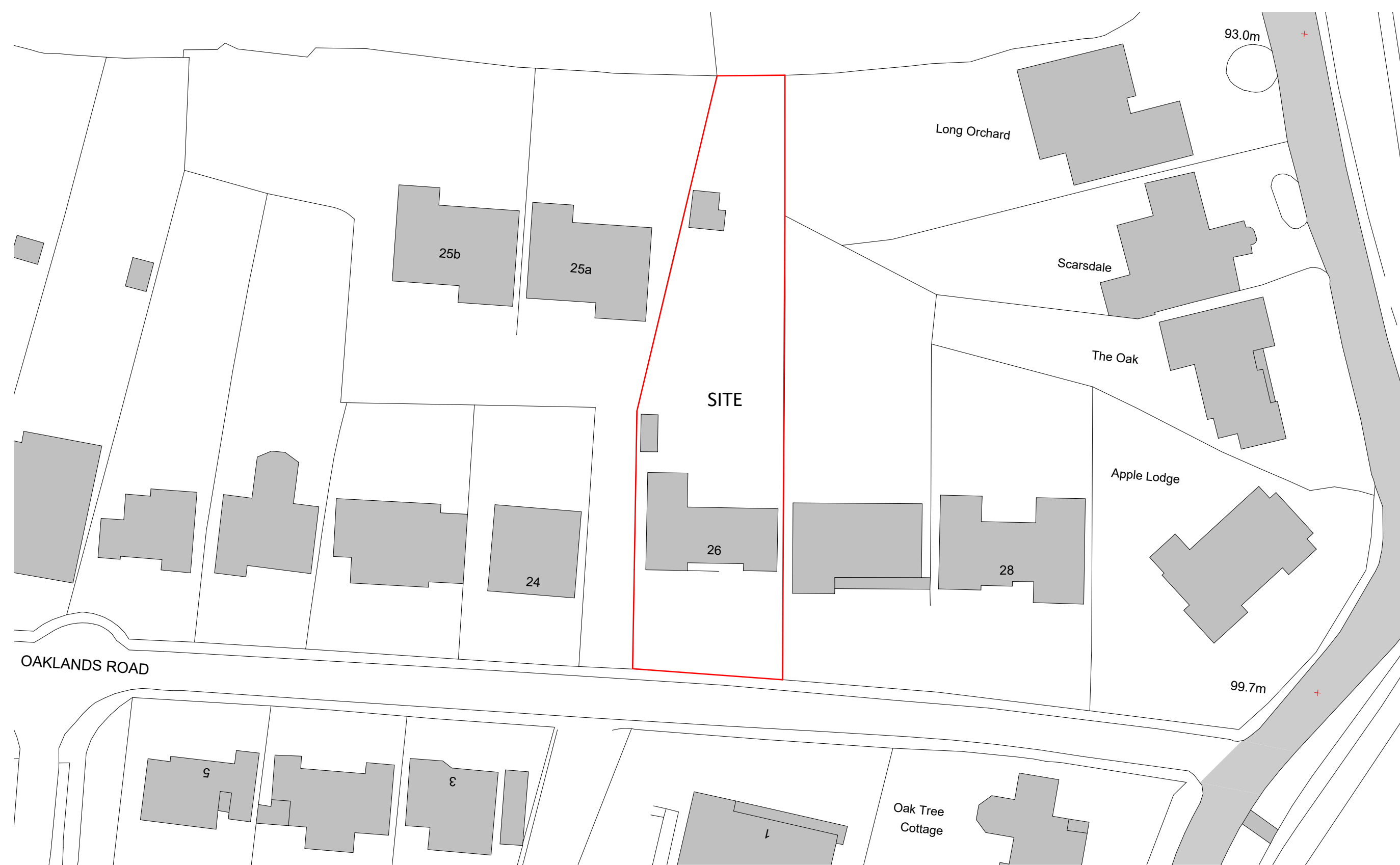
Existing Block Plan 1 : 500