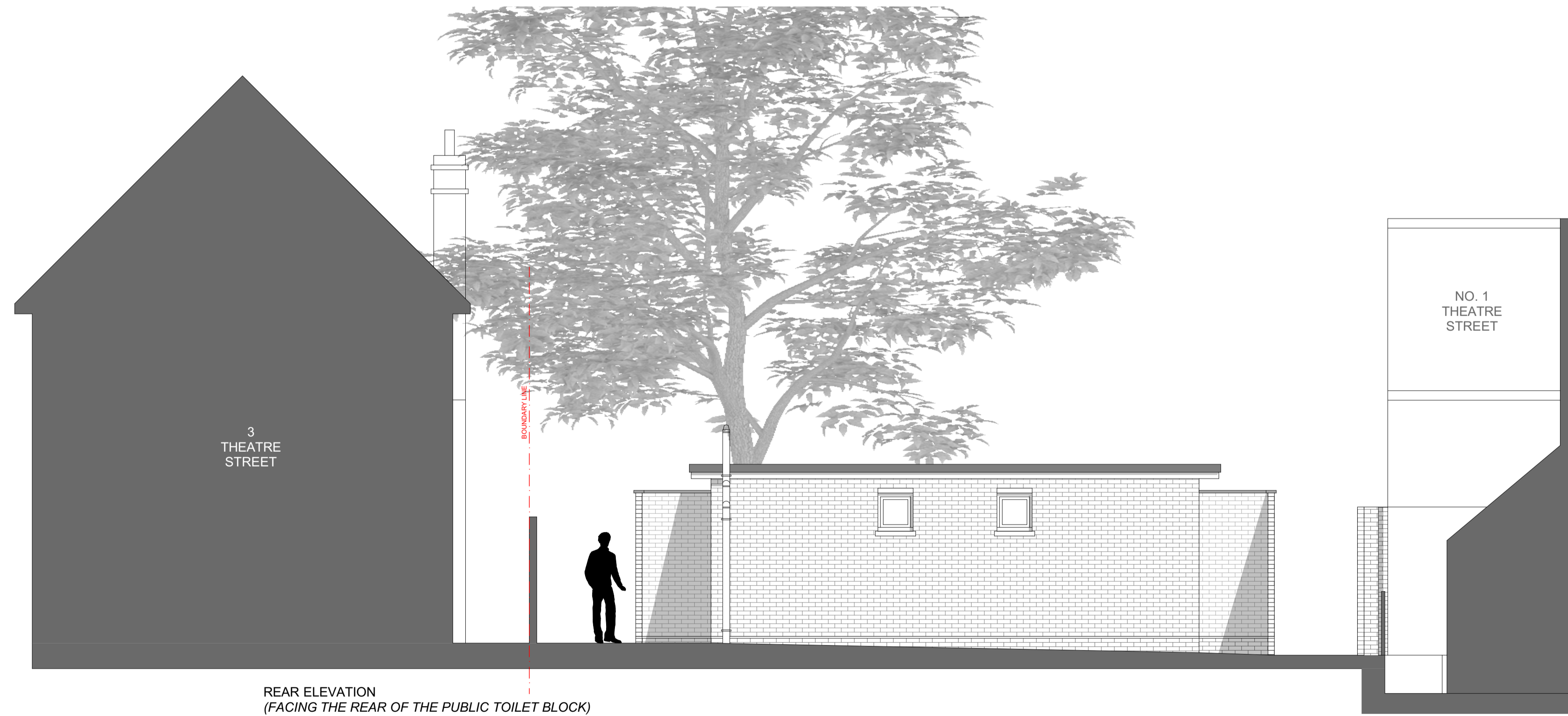
REAR ELEVATION (FACING THE REAR OF THE PUBLIC TOILET BLOCK)