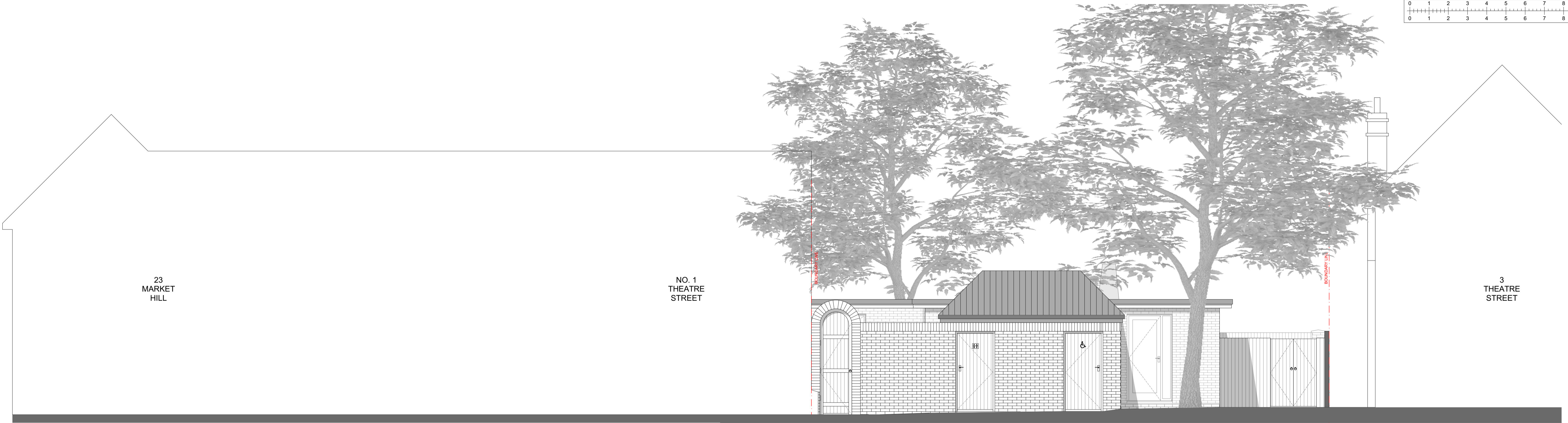
FRONT ELEVATION (FACING THE FRONT OF THE NEW PUBLIC TOILETS)