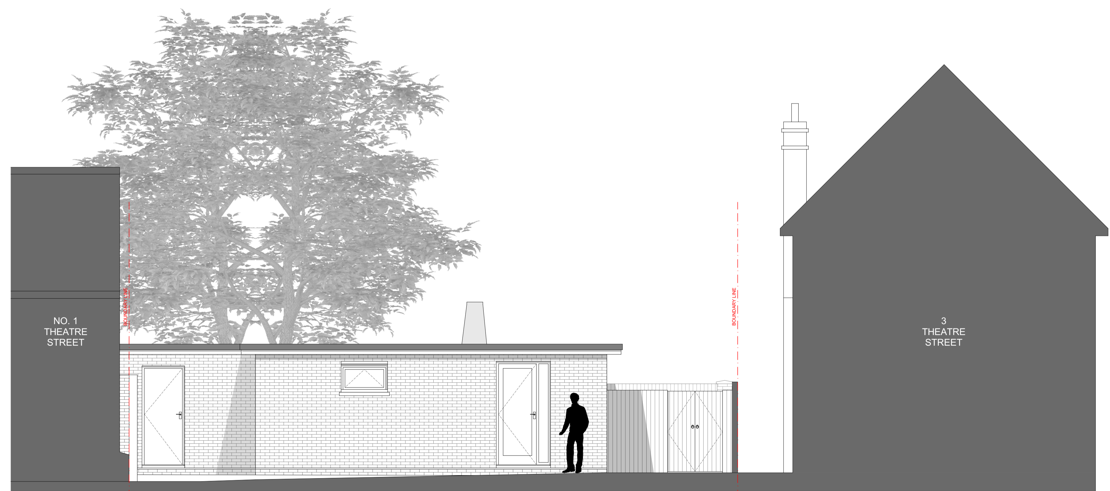
FRONT ELEVATION (FACING THE NEW REAR ENTRANCE TO THE GALLEY RESTAURANT)