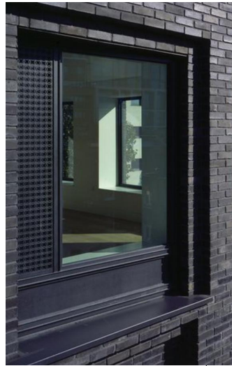
Recessed brick section

This drawing is protected under Copyright and at no time should any portion of this drawing be reproduced or copied without the permission of the Architect. (Design Copyright Act 1968) This drawings must not be used for purposes other than that for which it is provided. It is supplied without liability for any errors or omissions. Drawings only to be scaled for planning application purposes, all dimensions to be checked on site. All drawings subject to Statutory Authority Approval.