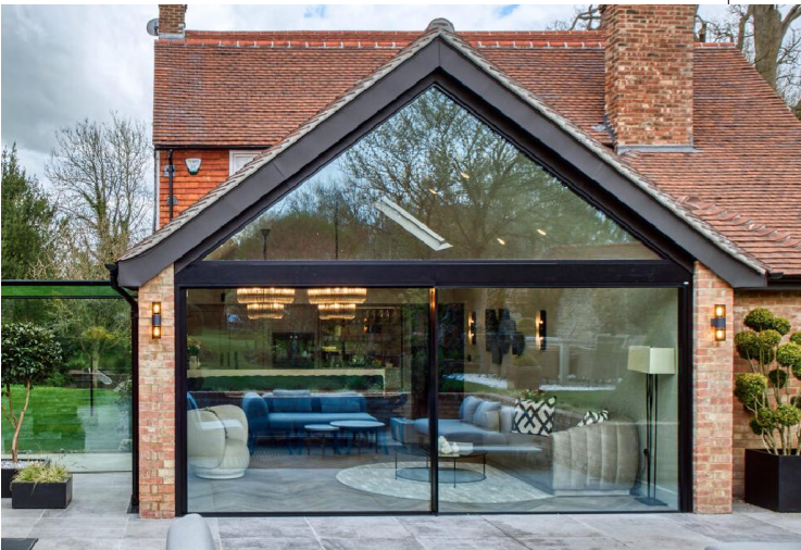
Gable glazing example