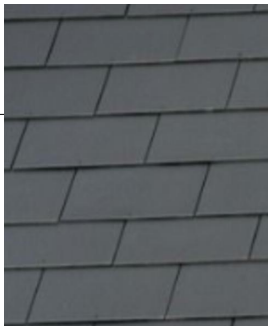
Fibre-cement dark grey tiles to main roof & bay windows