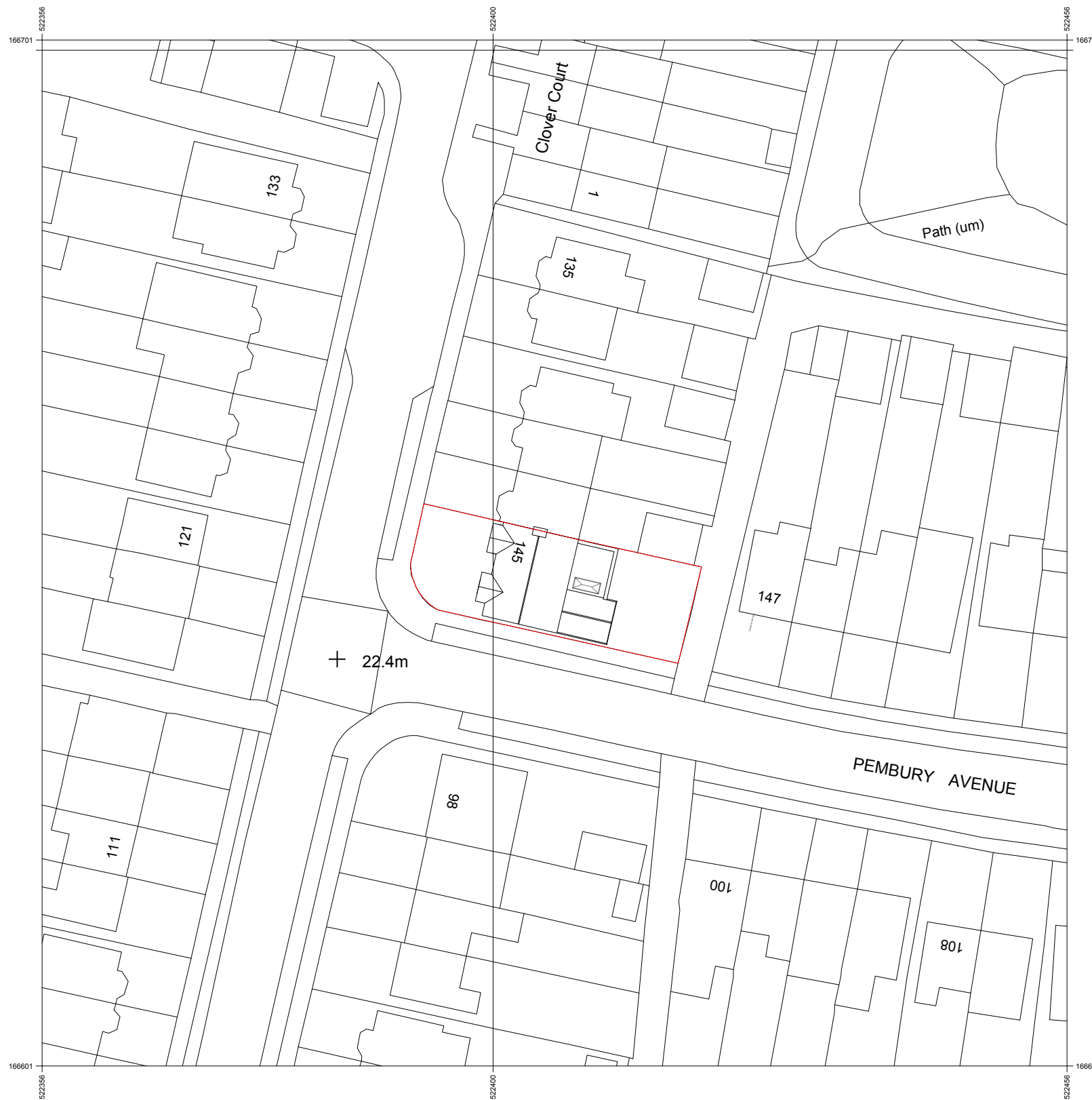
Proposed Block plan 1:500

This drawing is protected under Copyright and at no time should any portion of this drawing be reproduced or copied without the permission of the Architect. (Design Copyright Act 1968) This drawings must not be used for purposes other than that for which it is provided. It is supplied without liability for any errors or omissions. Drawings only to be scaled for planning application purposes, all dimensions to be checked on site. All drawings subject to Statutory Authority Approval.