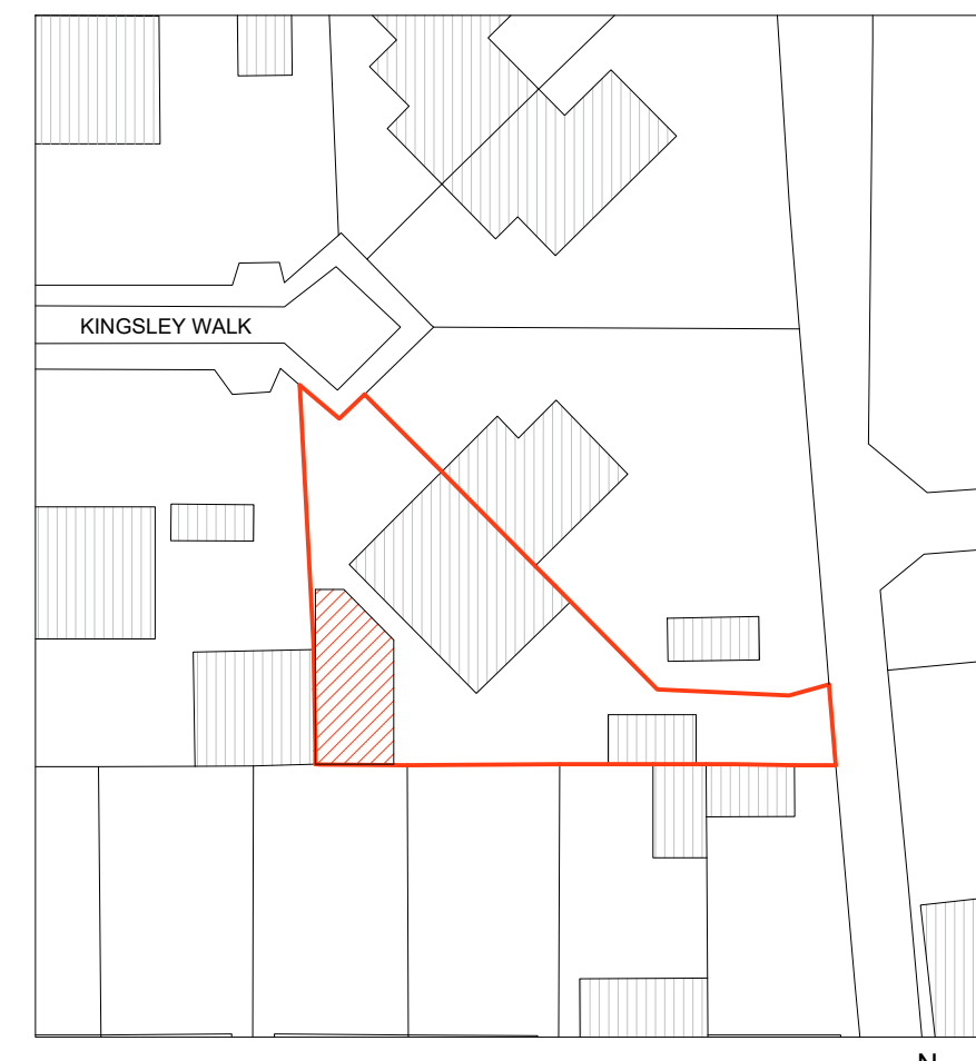
BLOCK PLAN scale 1:500