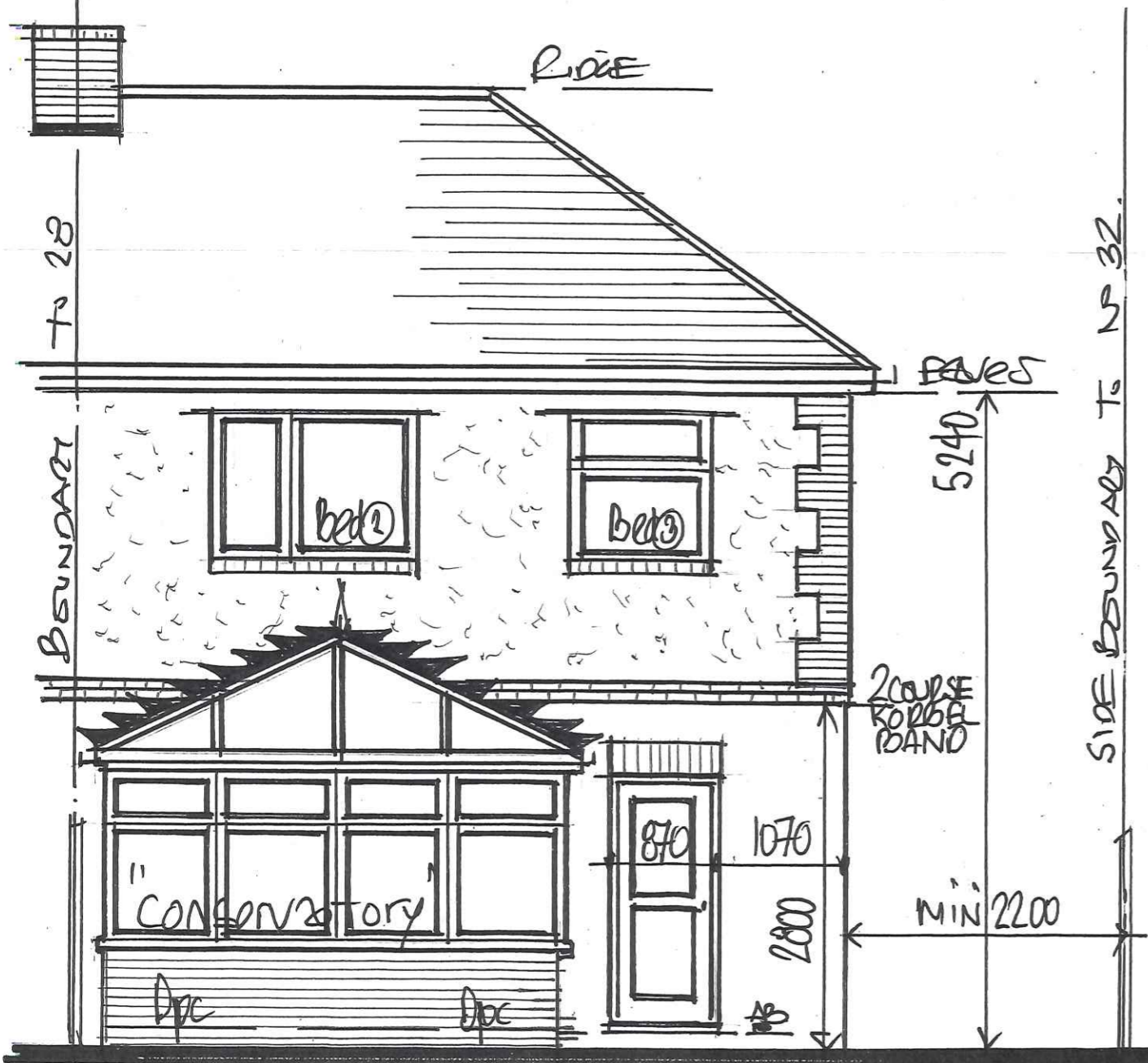
1:50 EXISTING "REAR" ELEVATION