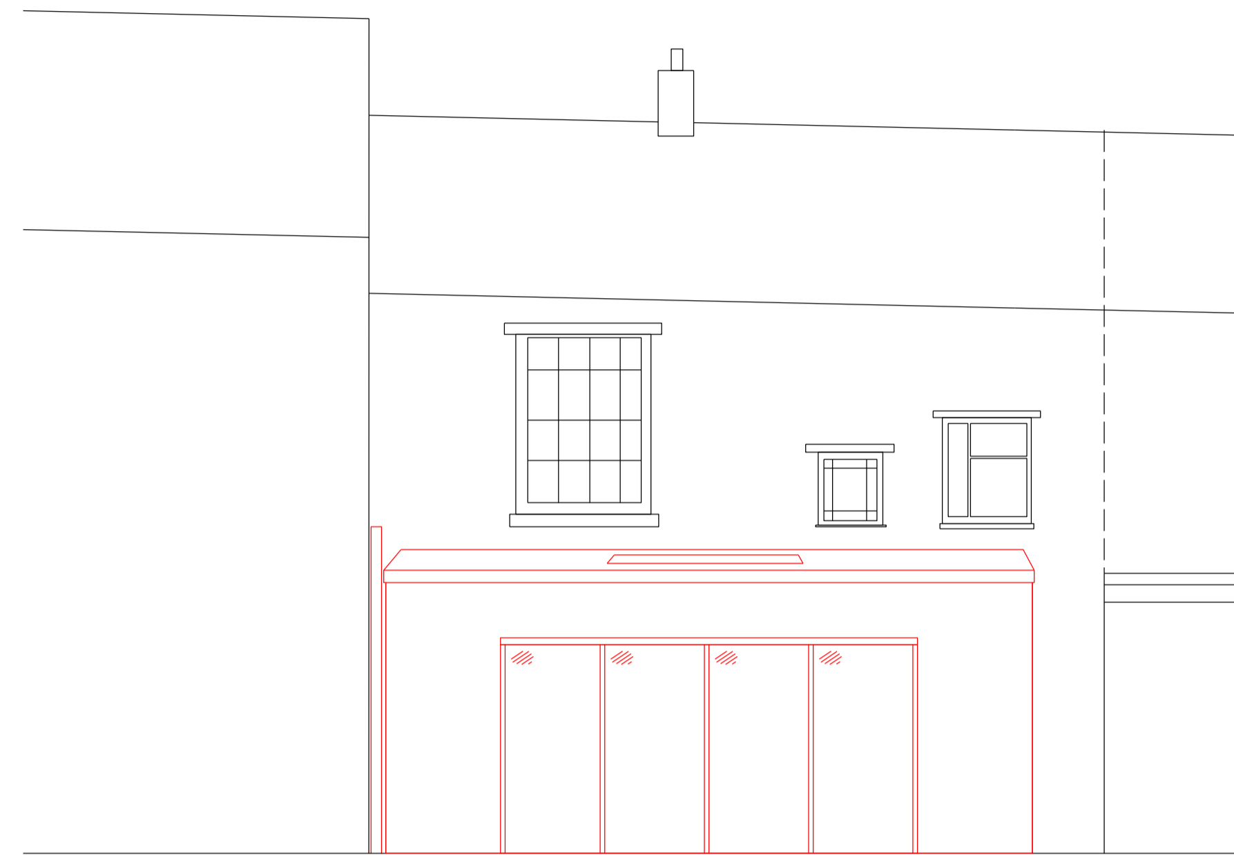
REAR ELEVATION SCALE 1:50