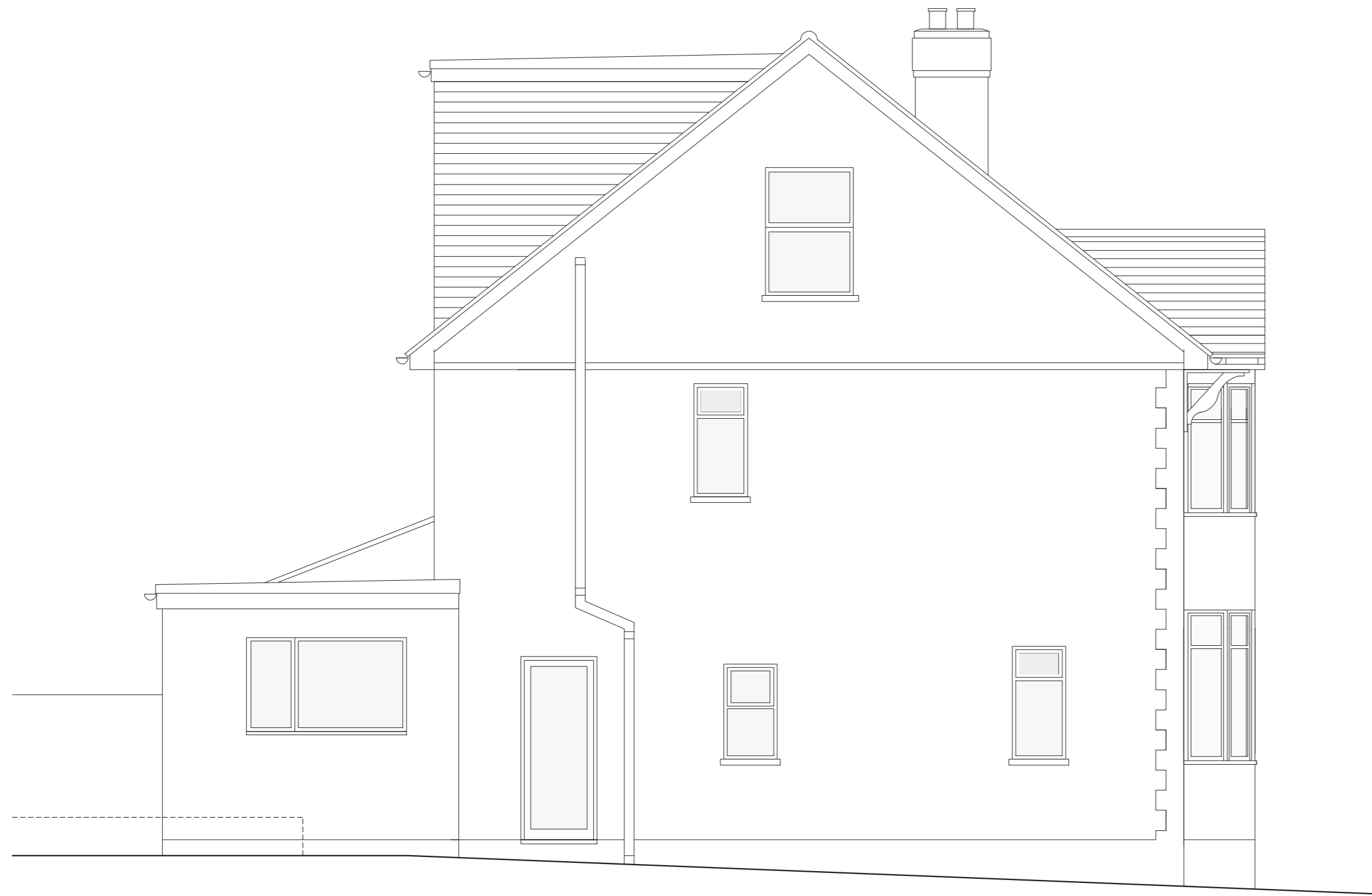
Existing Side (East) Elevation scale 1:50 @ A2