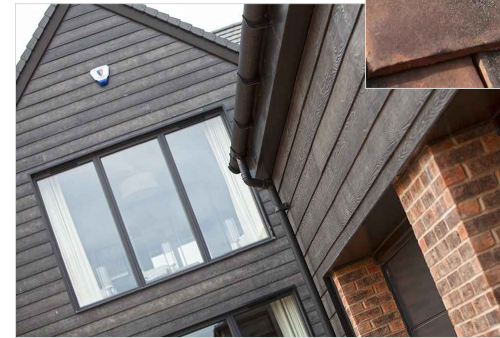
Black timber weatherboarding