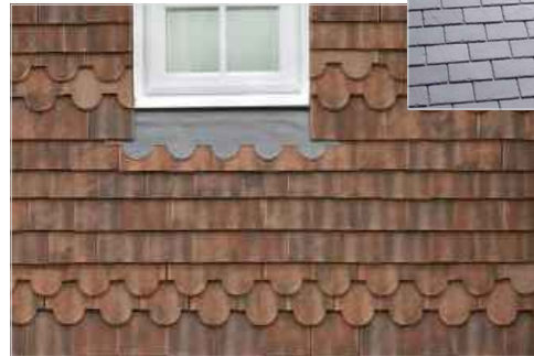
Clay tile hanging with scallop tiles