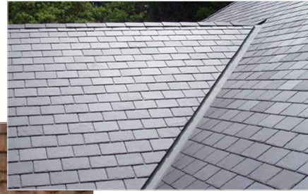
Genuine Slate roof tiles