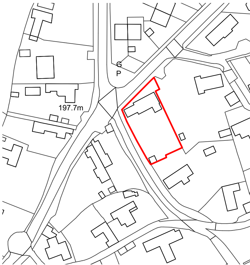
2 Existing Site Location Plan Scale: 1:1250