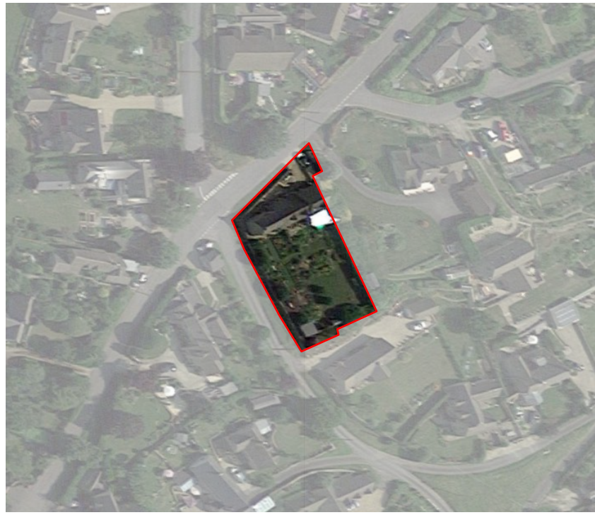
1 Existing Aerial View Not To Scale