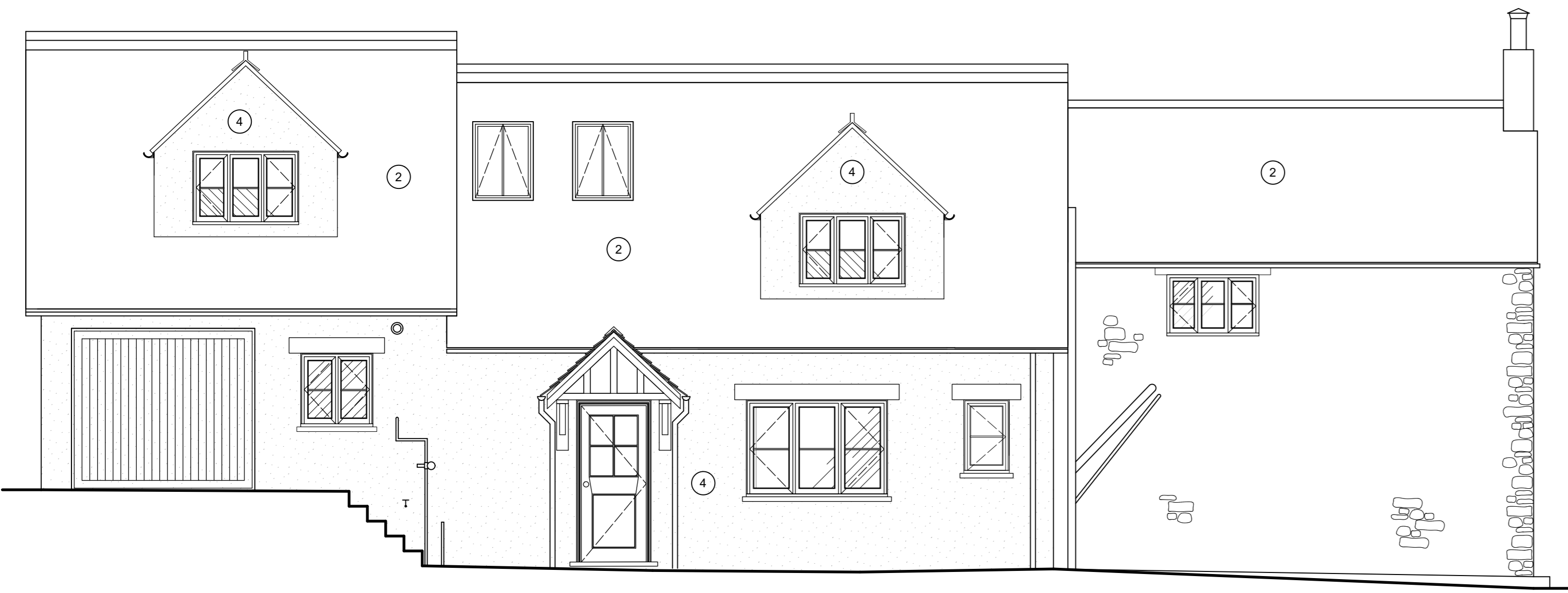
1 Proposed North West Elevation Scale: 1:50 @ A1