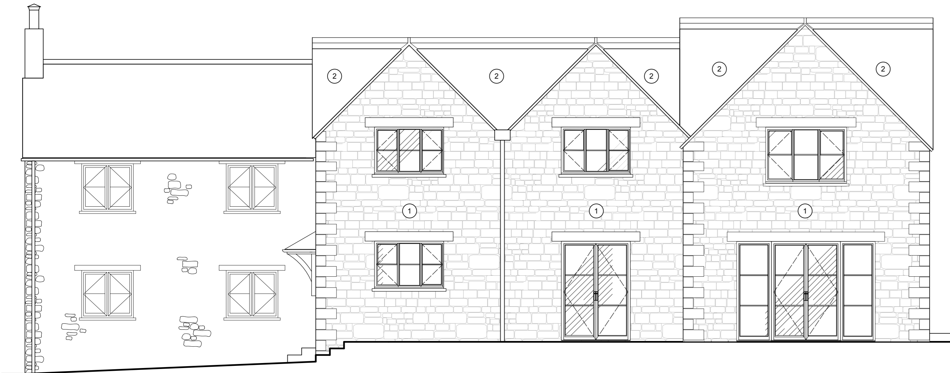
3 Proposed South East Elevation Scale: 1:50 @ A1