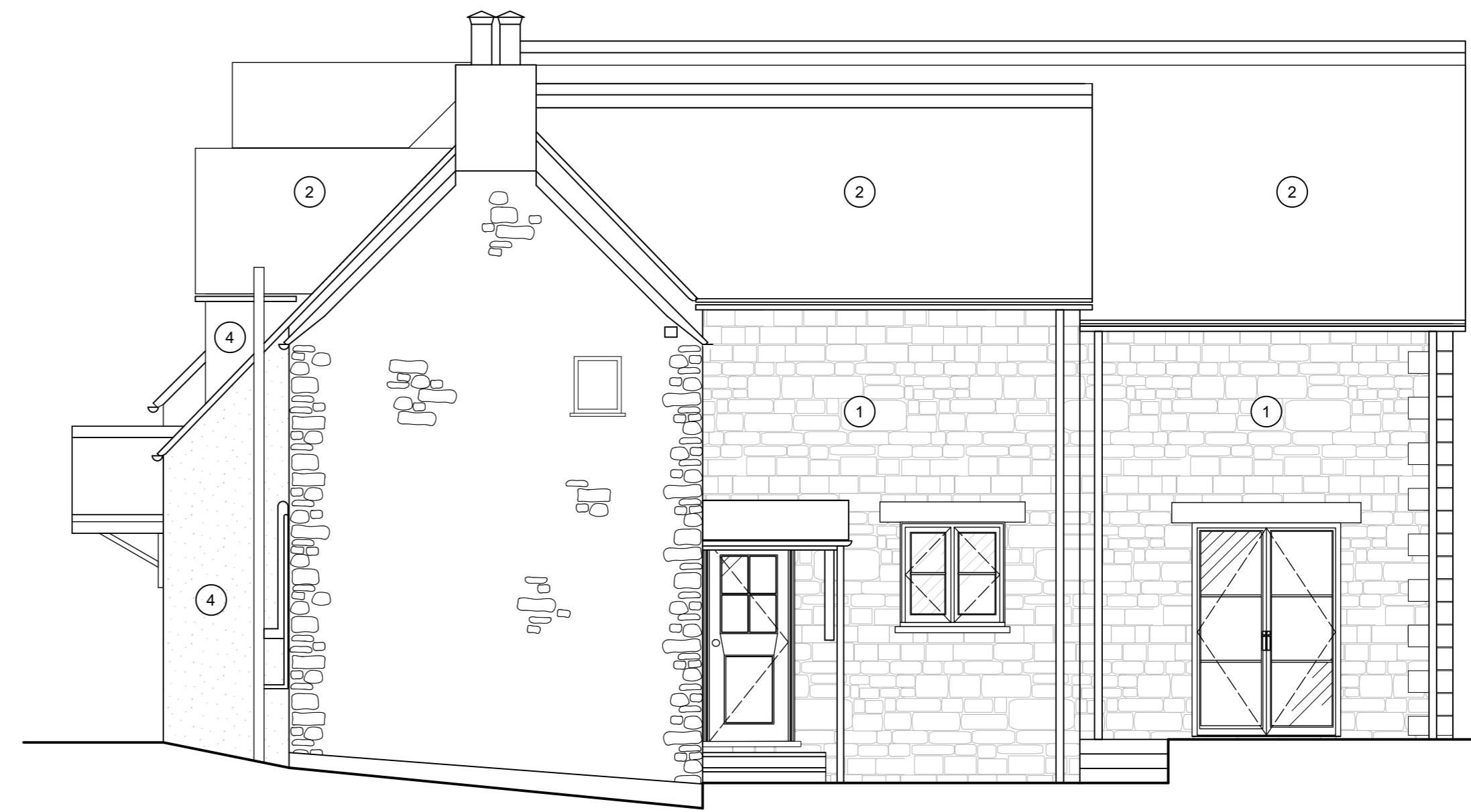
2 Proposed South West Elevation Scale: 1:50 @ A1