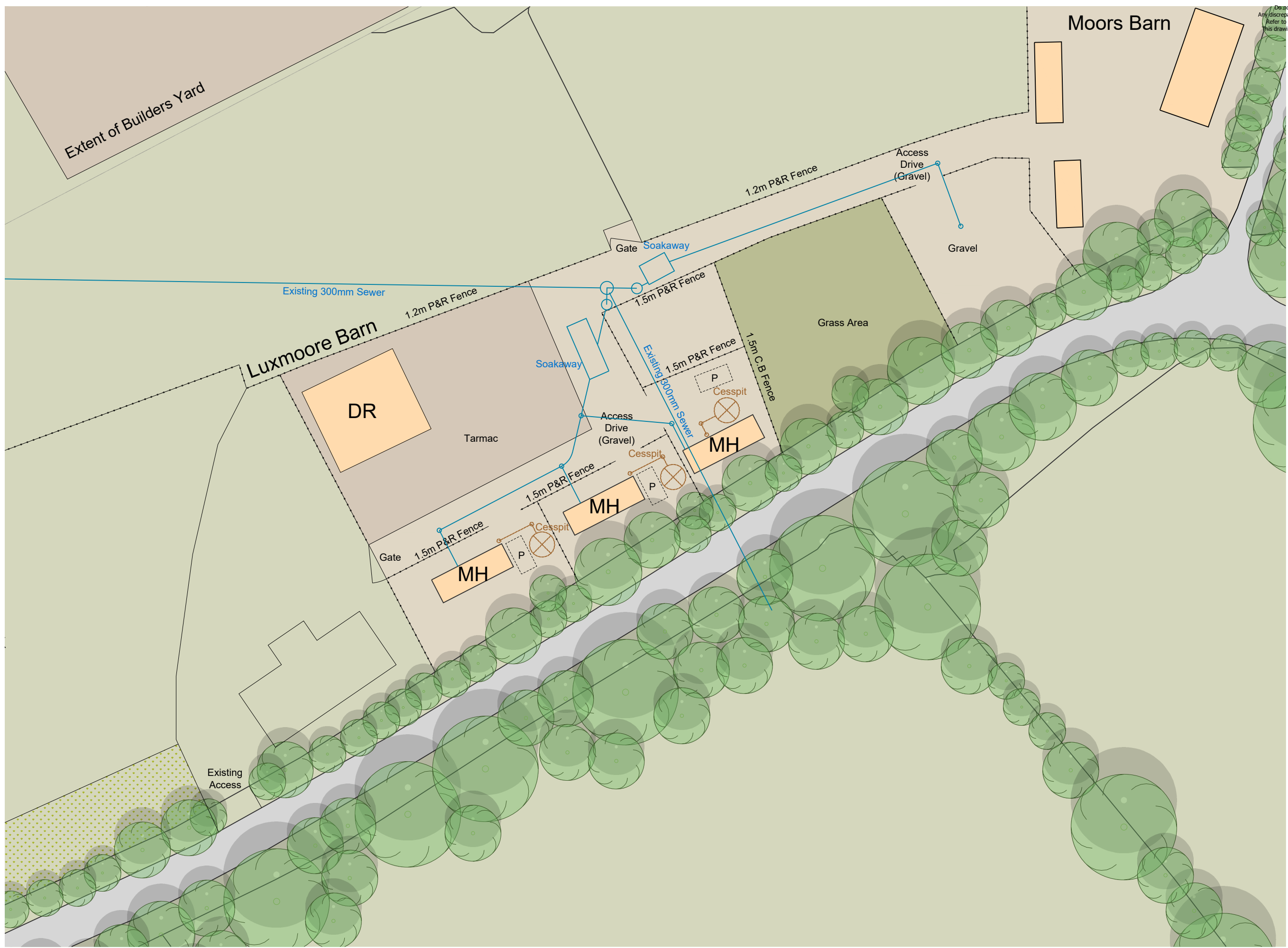
As Proposed Site Plan with Drainage Layout