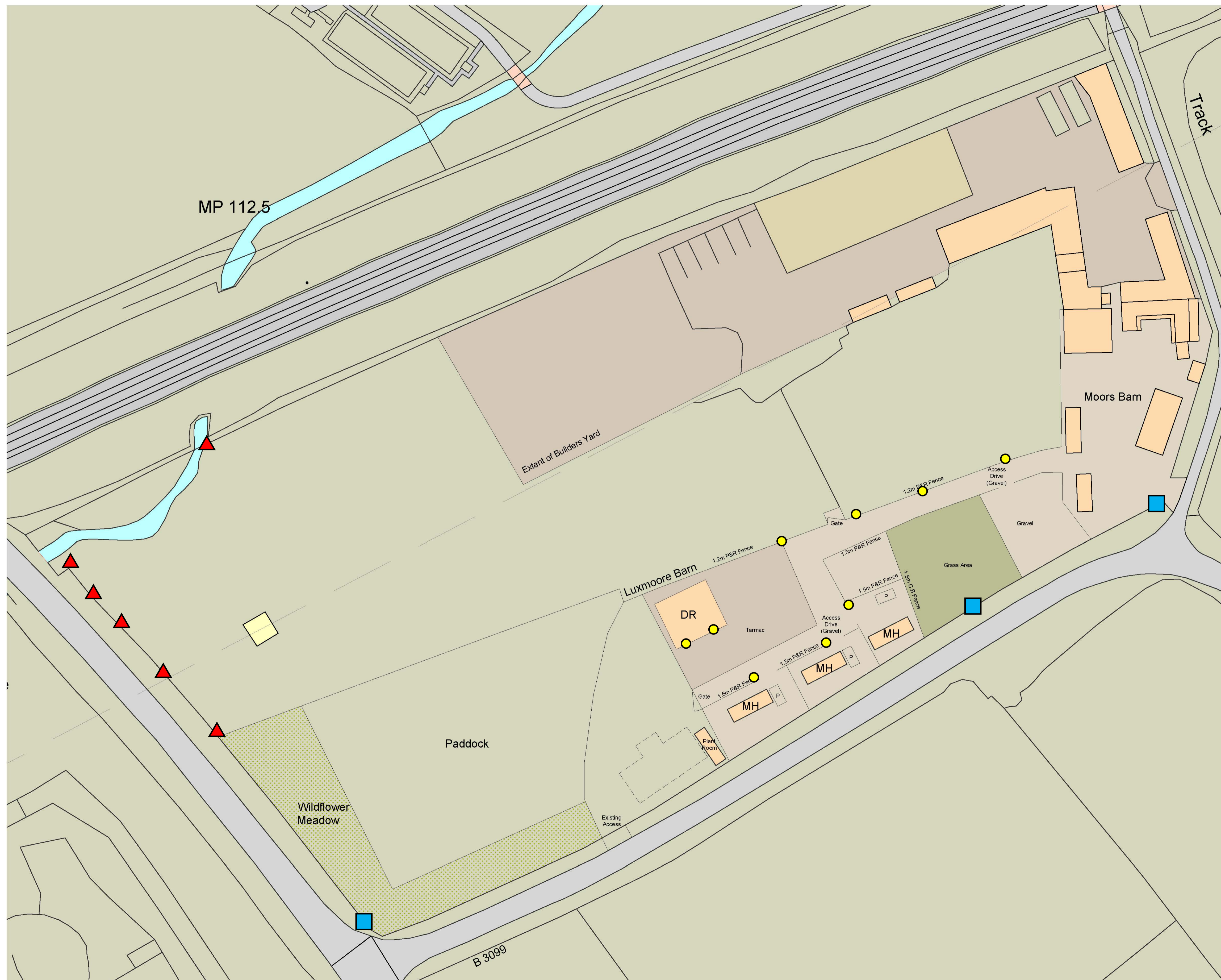
As Proposed Site Plan with Ecological Enhancement