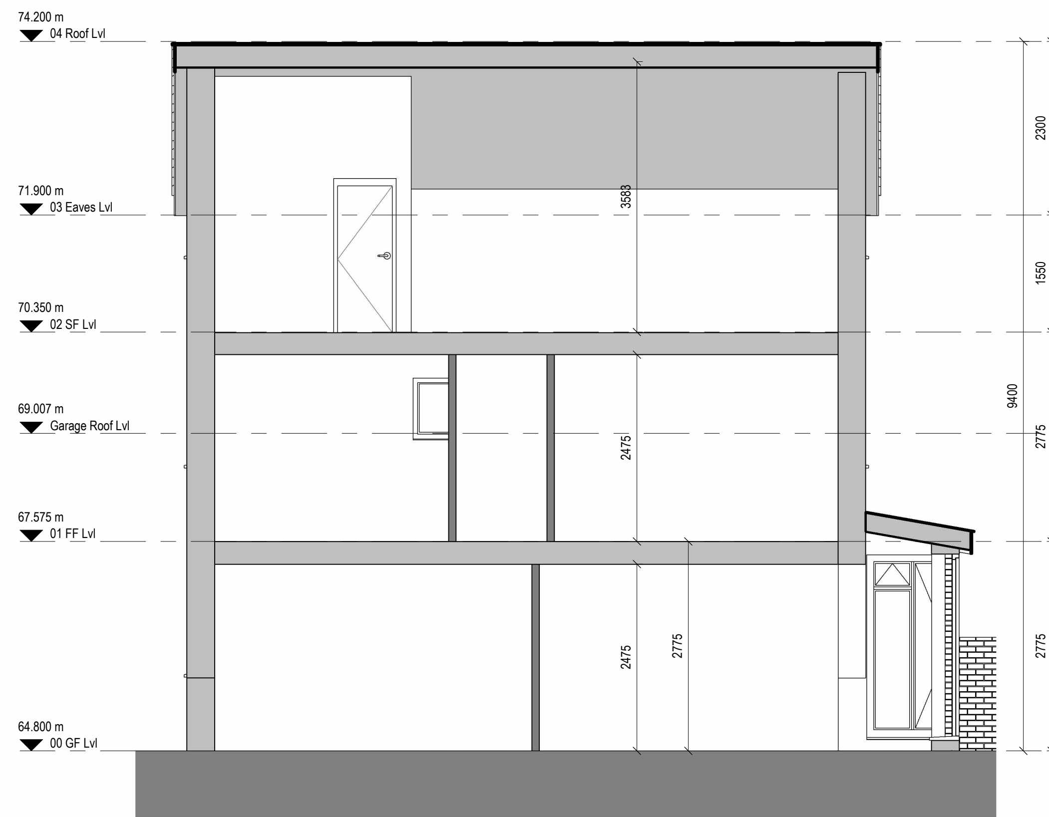
1 | 1 : 50 - Section A-A