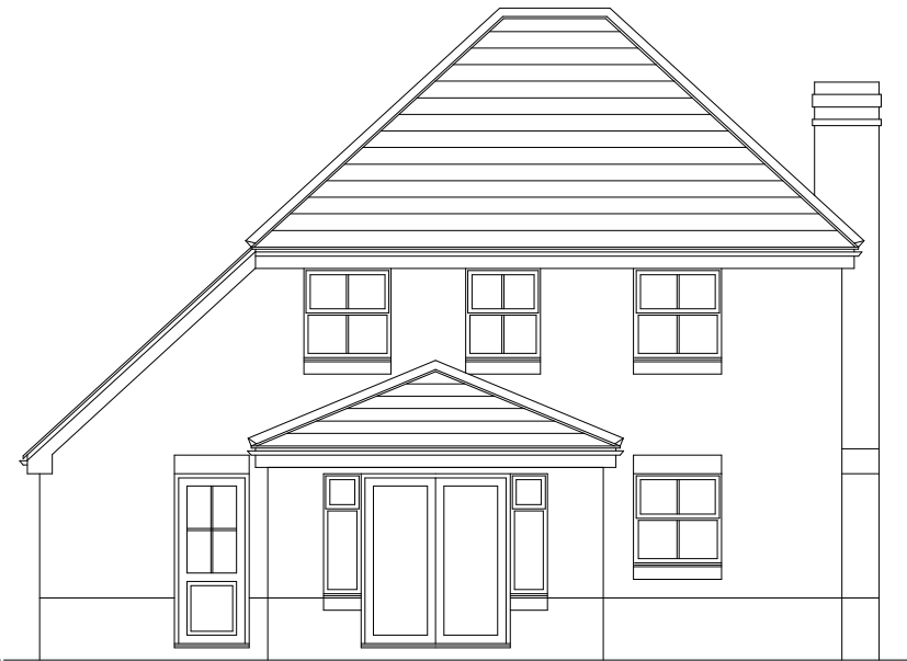
Existing Rear Elevation (scale 1:100@A3)