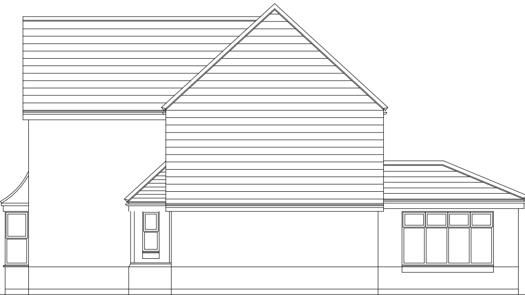
Existing L.H. Side Elevation (scale 1:100@A3)