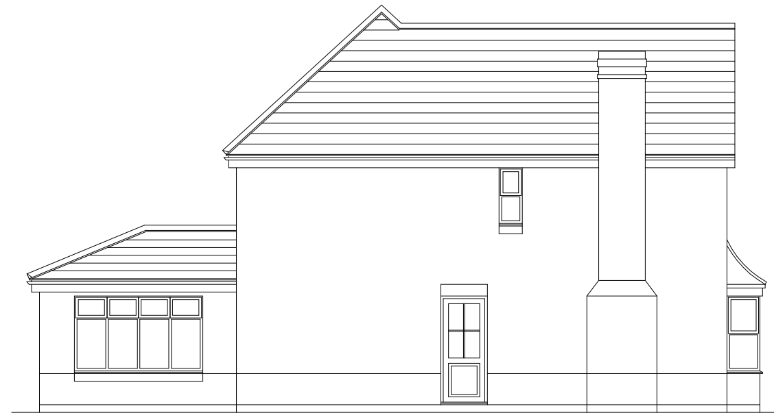
Existing R.H. Side Elevation (scale 1:100@A3)