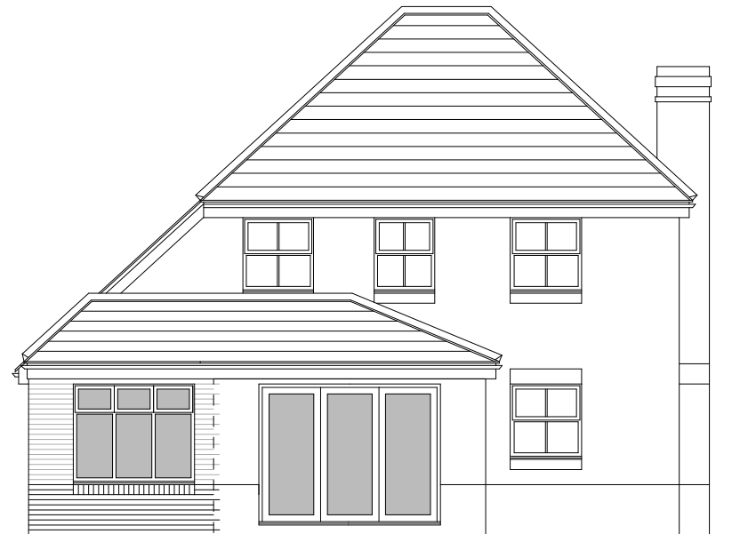
Proposed Rear Elevation (scale 1:100@A3)