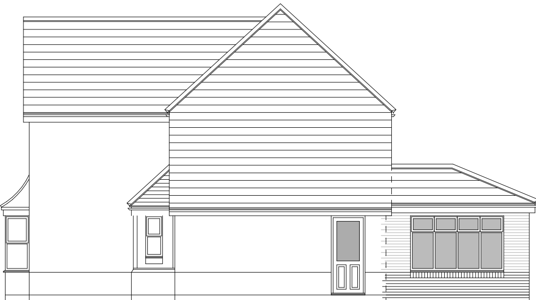
Proposed L.H. Side Elevation (scale 1:100@A3)