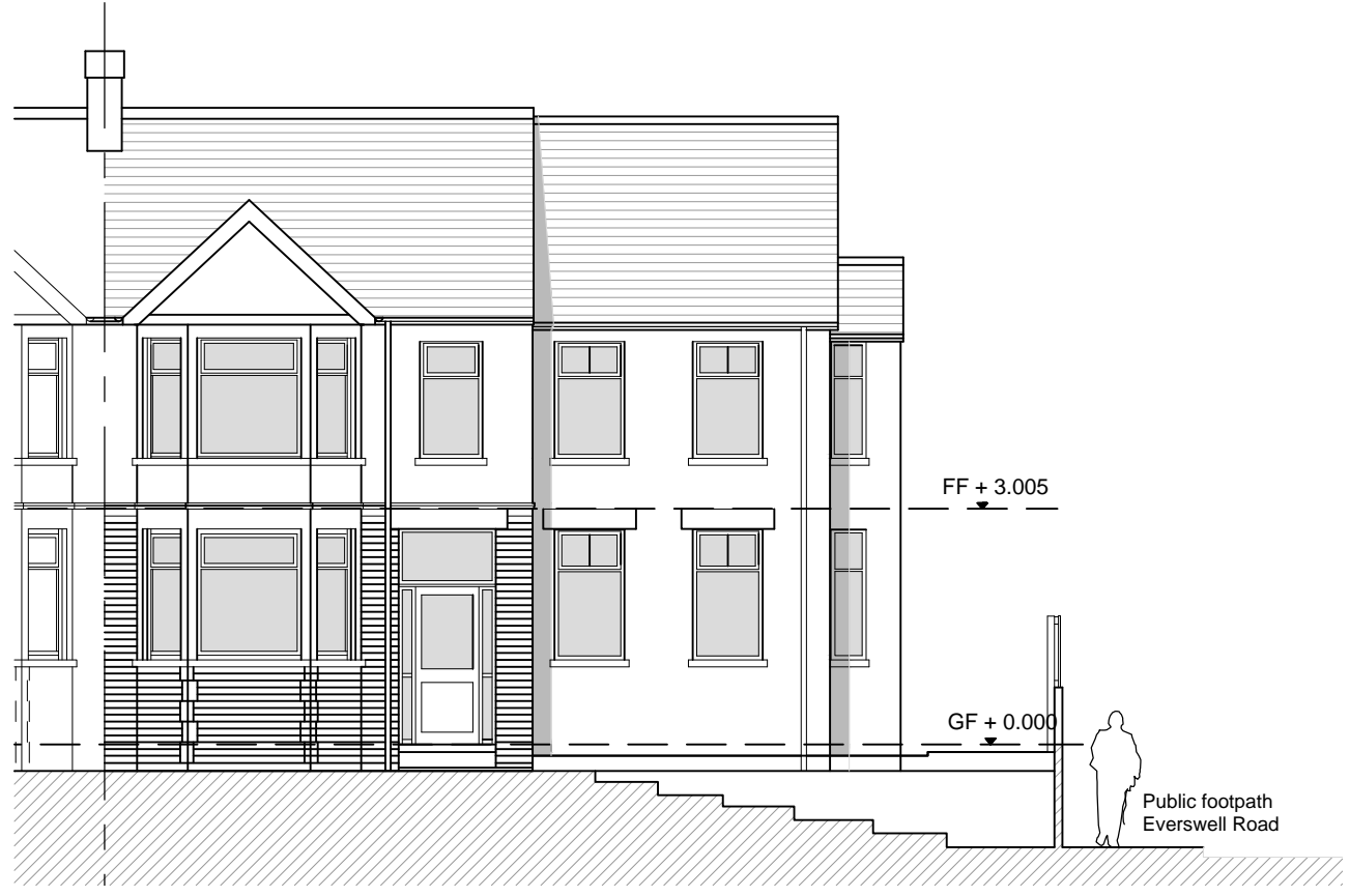
FRONT (SOUTH) ELEVATION TO BWLCH ROAD