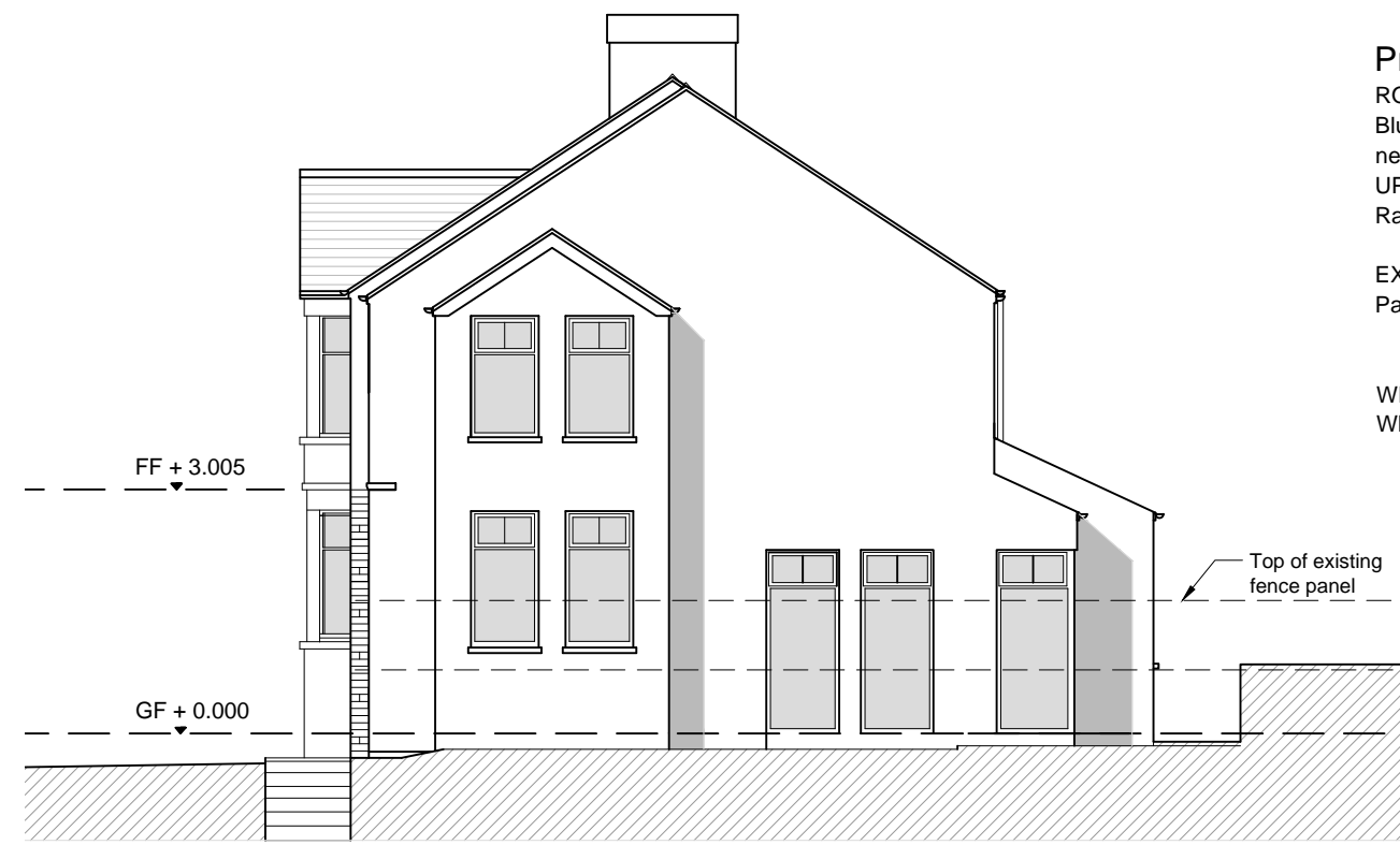
SIDE ELEVATION (WEST) TO EVERSHELL ROAD

Proposed Materials/Finishes ROOF Blue/black composite slate to existing and new roof UPVC fascias colour: black Rainwater goods: black EXTERNAL WALL Painted render to match existing WINDOWS/DOORS White UPVC