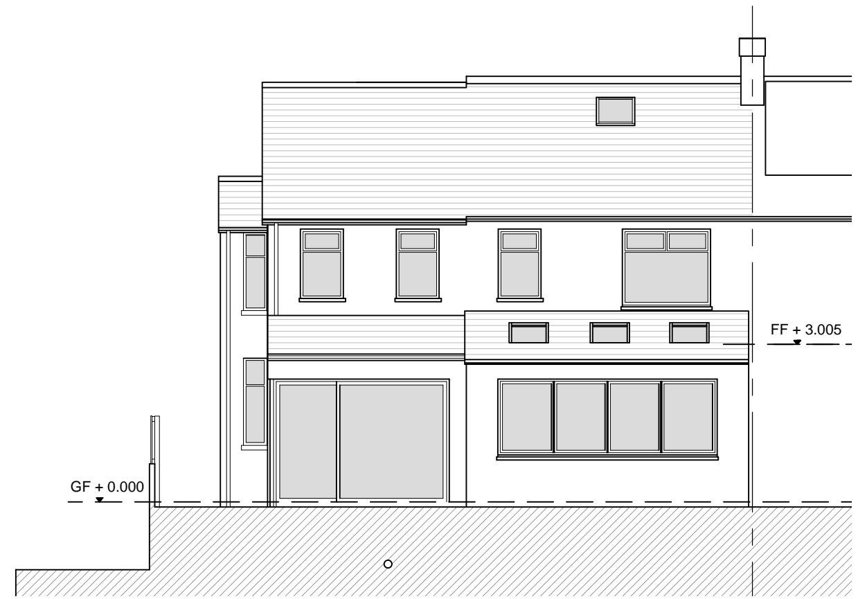
REAR (NORTH) ELEVATION

Proposed Materials/Finishes ROOF Blue/black composite slate to existing and new roof UPVC fascias colour: black Rainwater goods: black EXTERNAL WALL Painted render to match existing WINDOWS/DOORS White UPVC