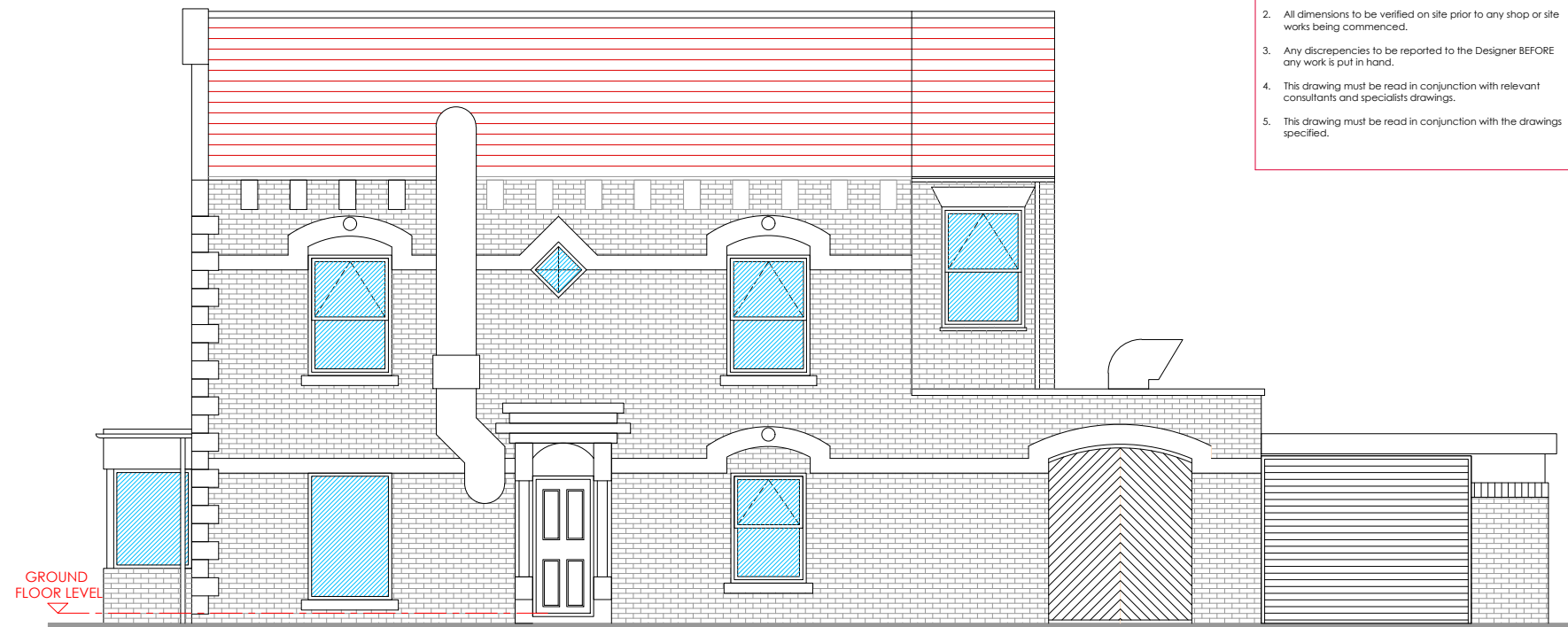
Existing South Elevation (Side)