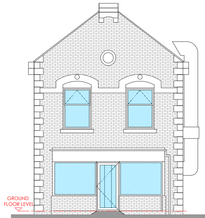
Existing West Elevation (Front)