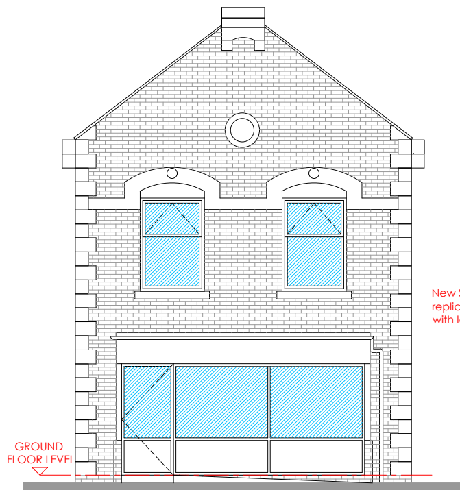
Proposed West Elevation (Front)