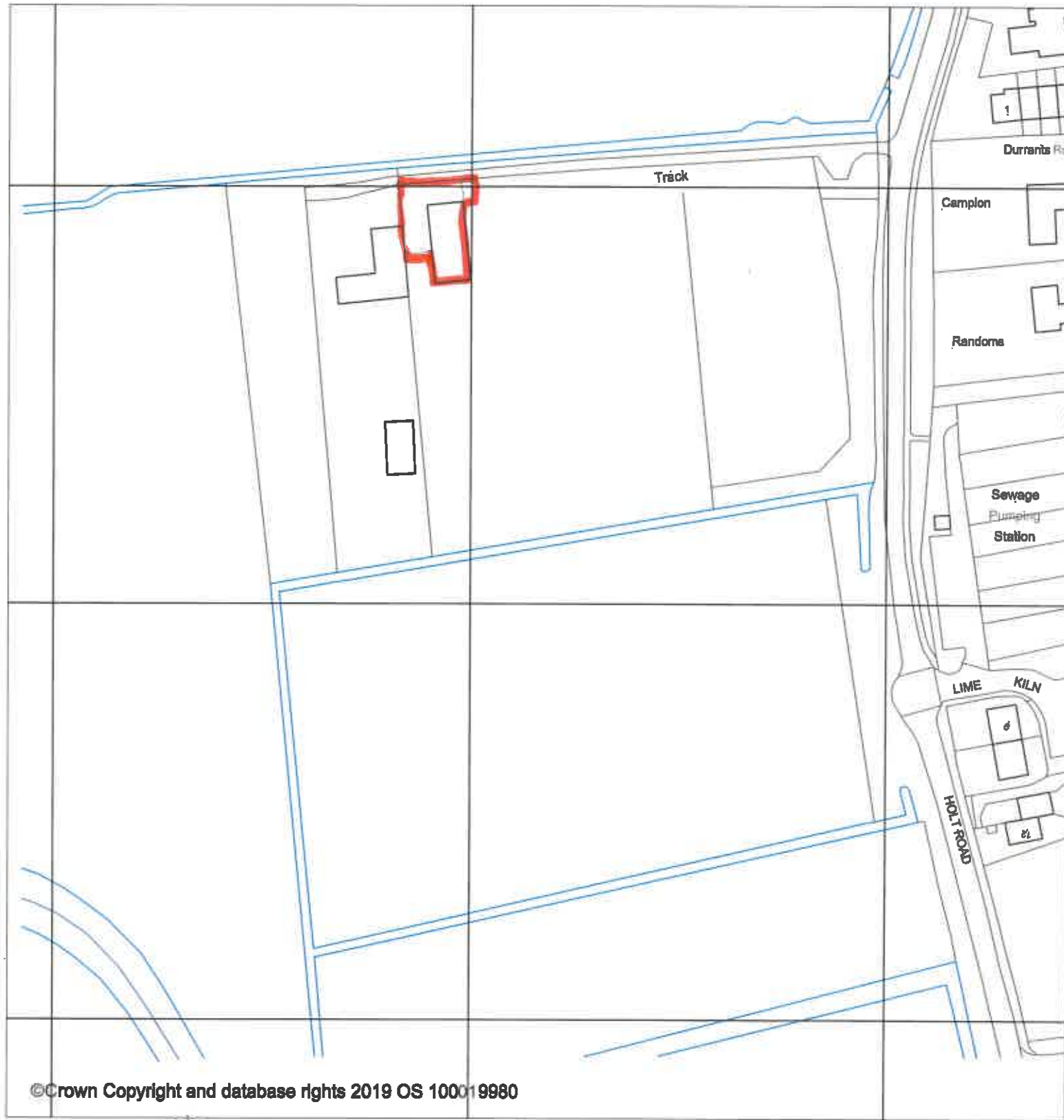
SITE LOCATION SCALE 1:1250