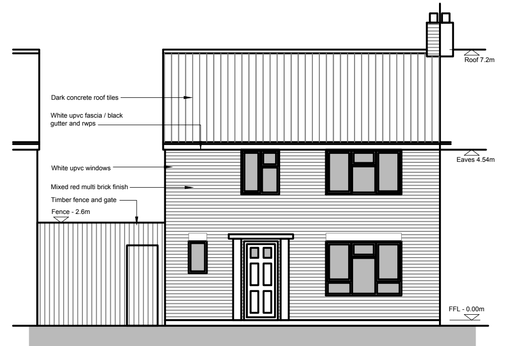
01 Existing Front Elevation 1:100 @ A3

DATE 18.09.2023 SHEET No. (08) 003 REV. -