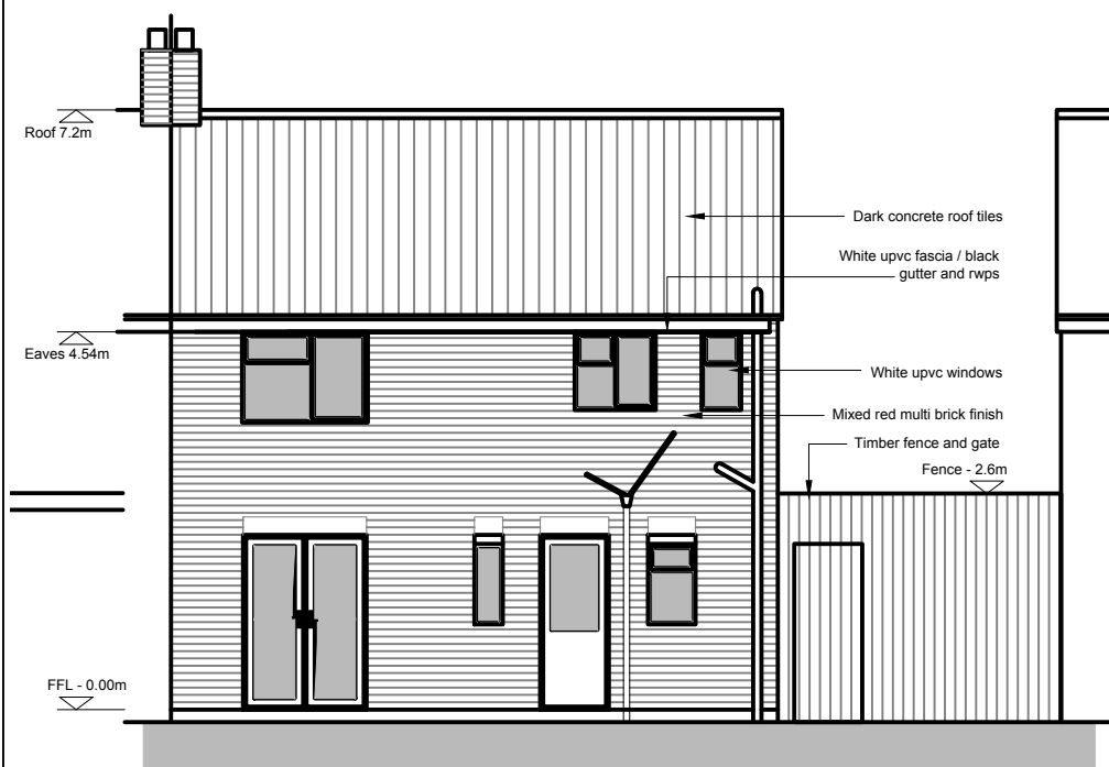
01 Existing Rear Elevation 1:100 @ A3