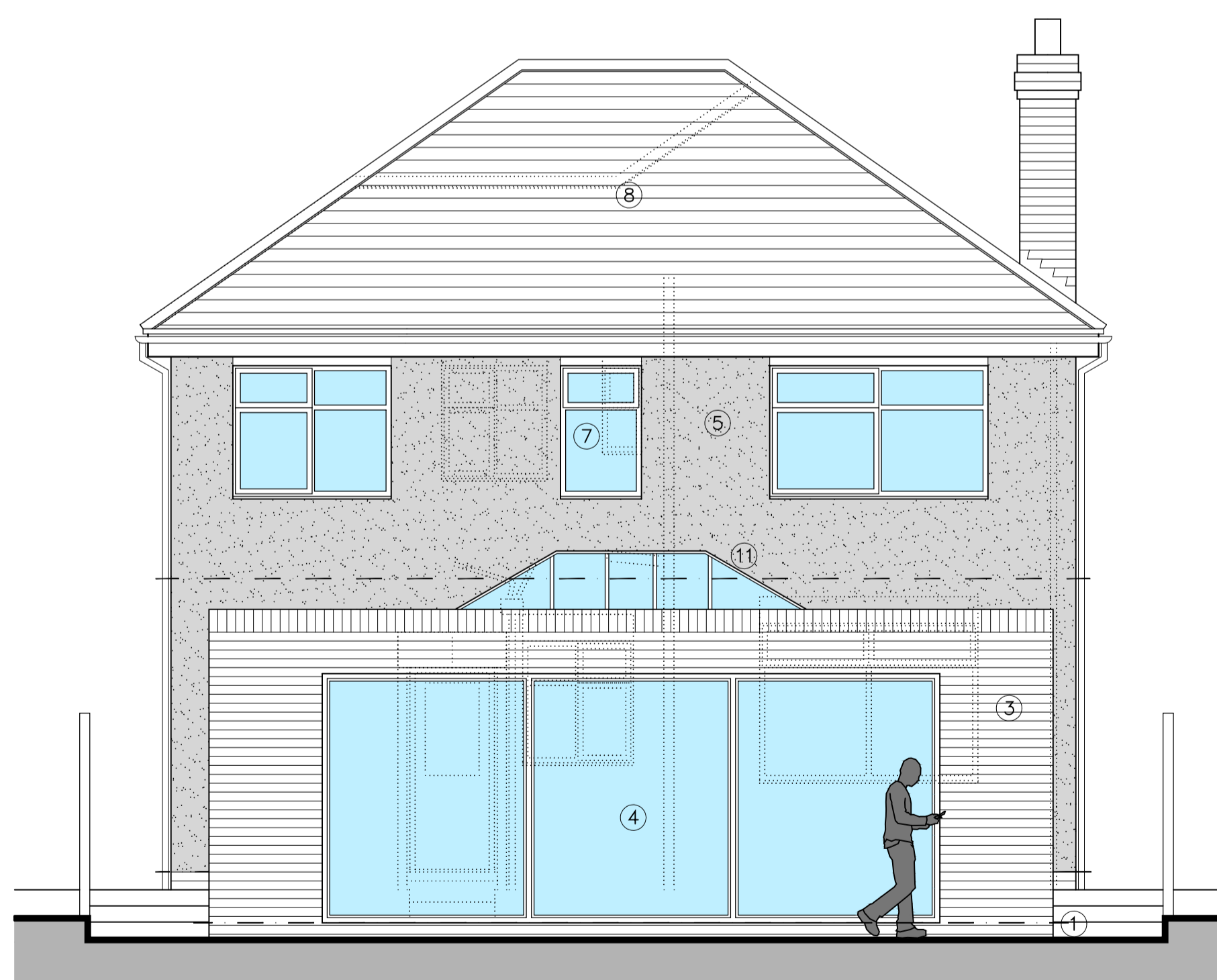
proposed rear elevation (s - e)

REAR SINGLE STOREY EXTENSION NOT TO BE INCLUDED IN PLANNING APPLICATION. WORK TO BE CARRIED OUT UNDER PERMITTED DEVELOPMENT AS CONFIRMED BY CITY OF LINCOLN COUNCIL.