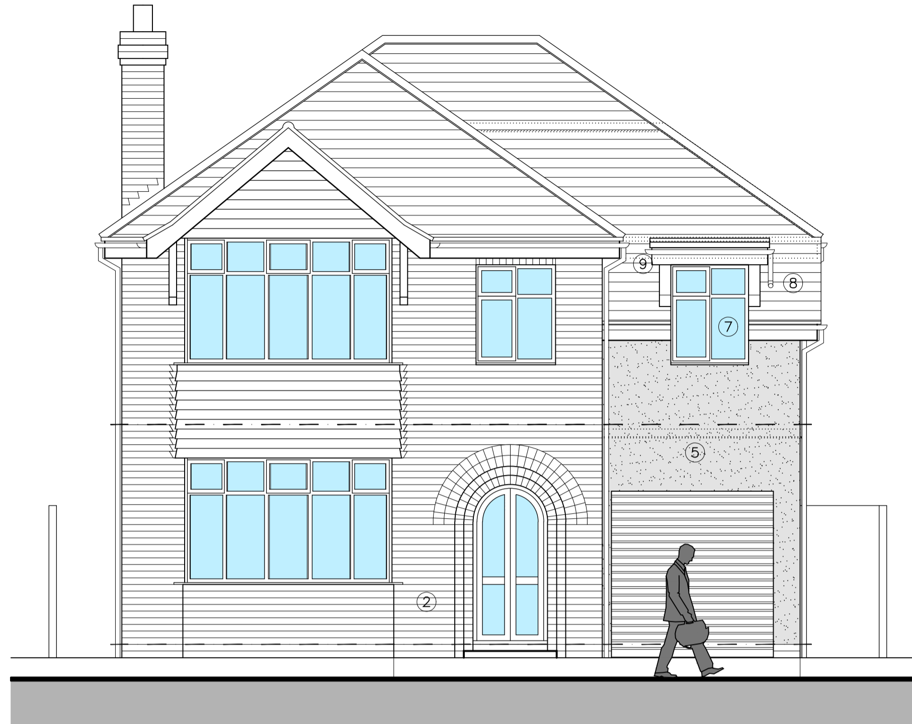
proposed front elevation (n - w)

A Amended in line with client comments. (13/02/23) B Amended in line with client comments. (15/02/23)