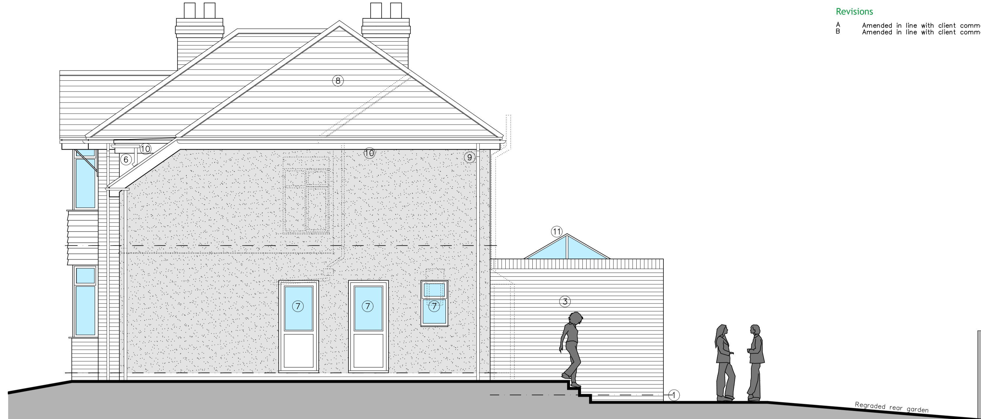
proposed side elevation (s - w)

REAR SINGLE STOREY EXTENSION NOT TO BE INCLUDED IN PLANNING APPLICATION. WORK TO BE CARRIED OUT UNDER PERMITTED DEVELOPMENT AS CONFIRMED BY CITY OF LINCOLN COUNCIL.