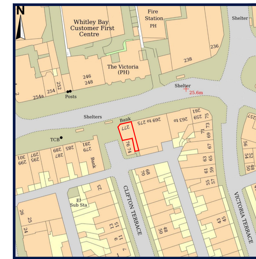
LOCATION PLAN - 1:1250 @ A1