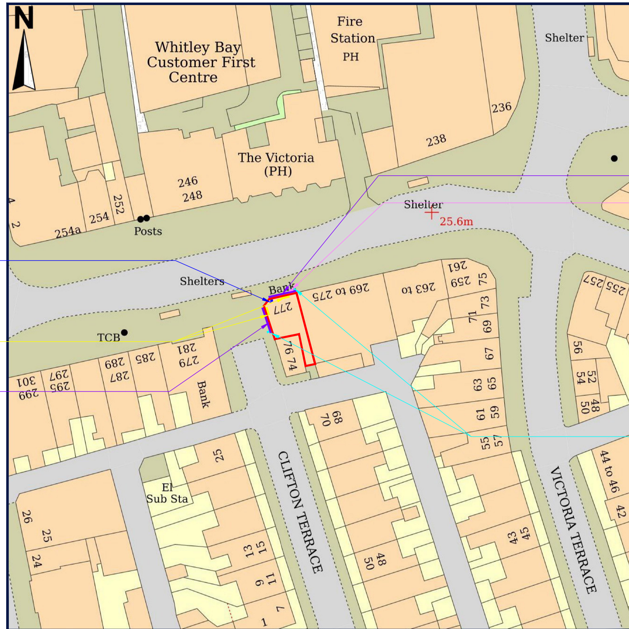
BLOCK PLAN - 1:500 @ A1