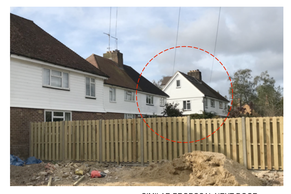
SIMILAR PROPOSAL NEXT DOOR