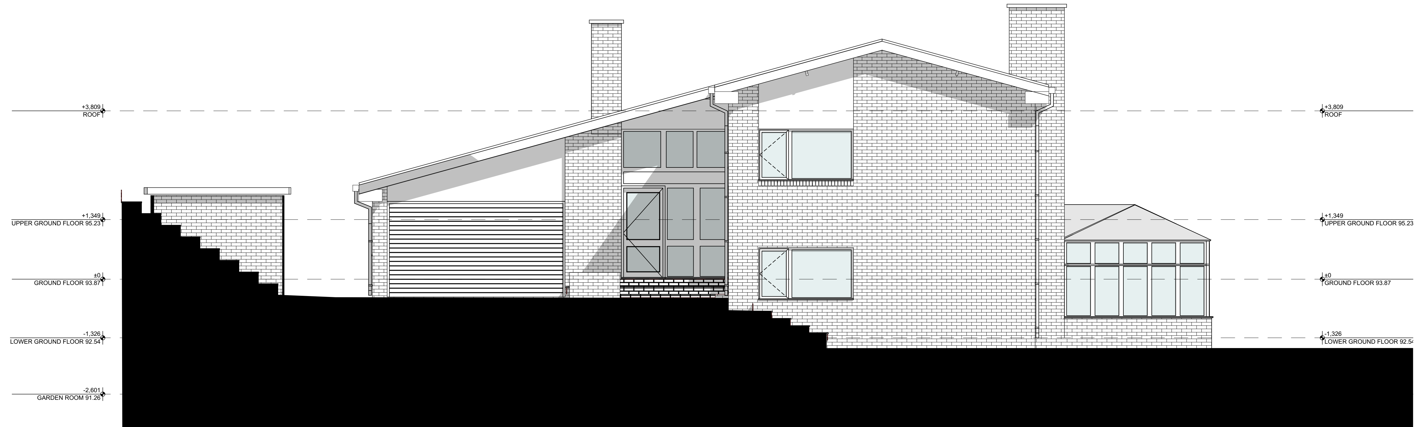
FRONT ELEVATION H (E) 1:50