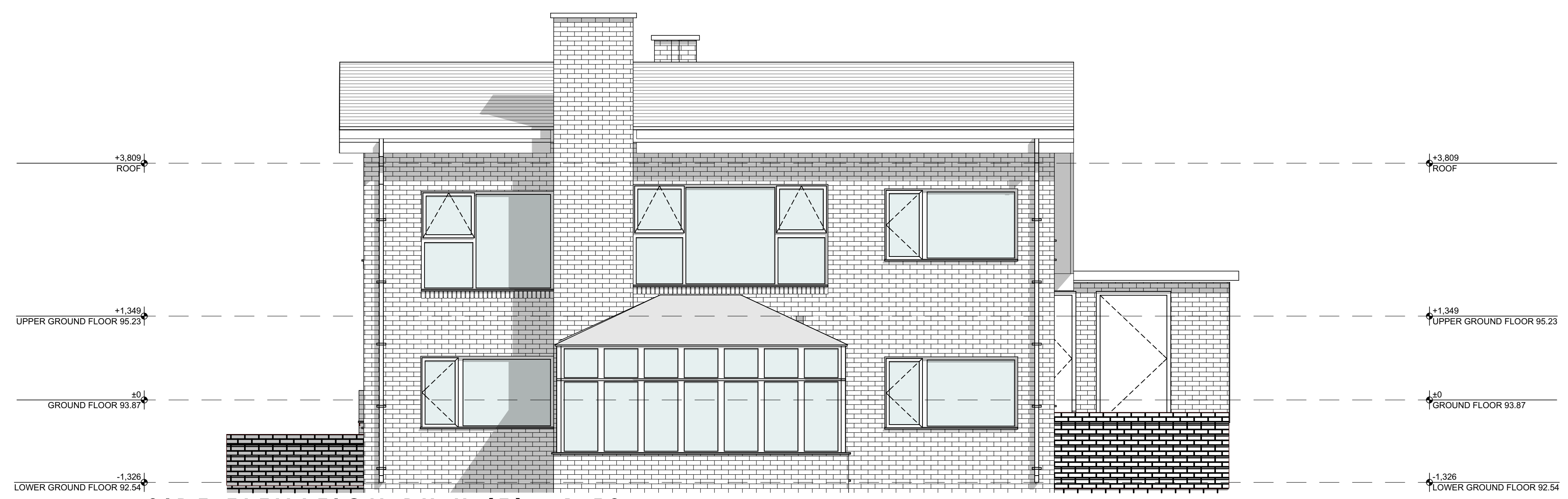
SIDE ELEVATION RH H (E) 1:50